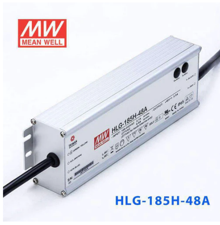
RF29209 HLG – 185H – 48A