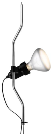
F5500058 Parentesi complement element - Nickel