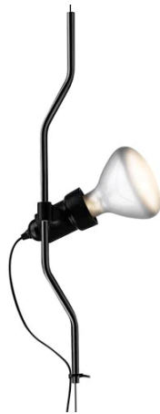
F5500030 Parentesi complement element - Black