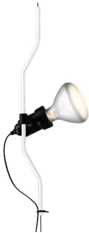
F5500009 Parentesi complement element - White

by Achille Castiglioni & Pio Manzù , 1971