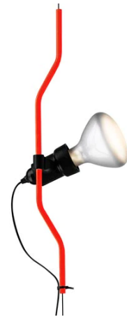
F5500035 Parentesi complement element - Red