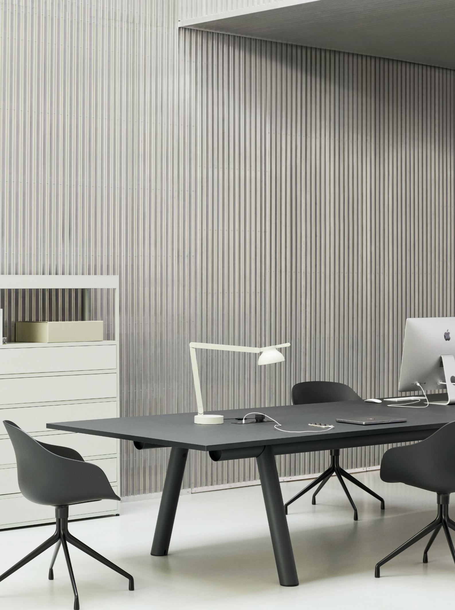
Boa Table | Black laminate tabletop & Charcoal frame