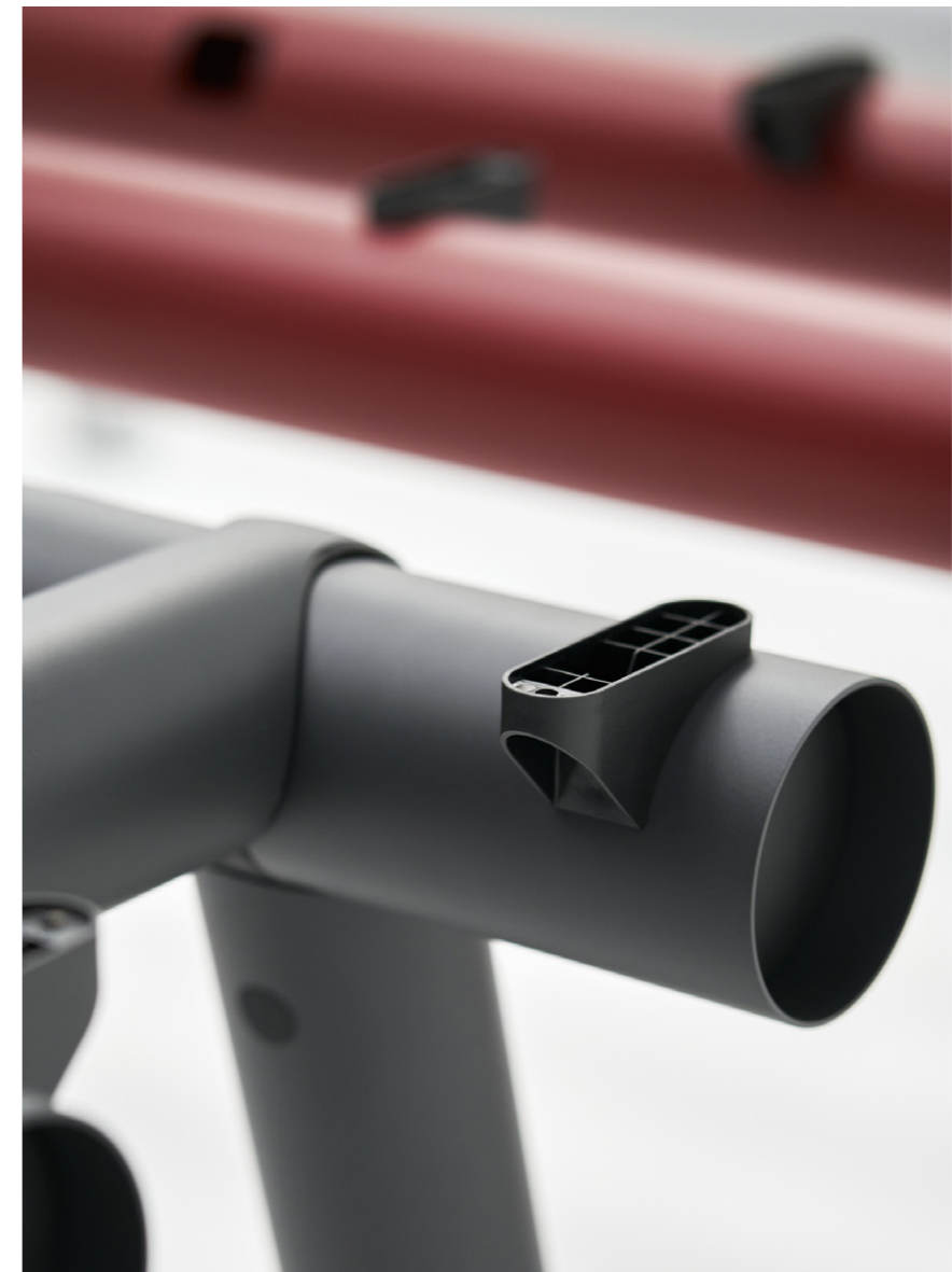
Boa Table Frame | Charcoal & Barn red