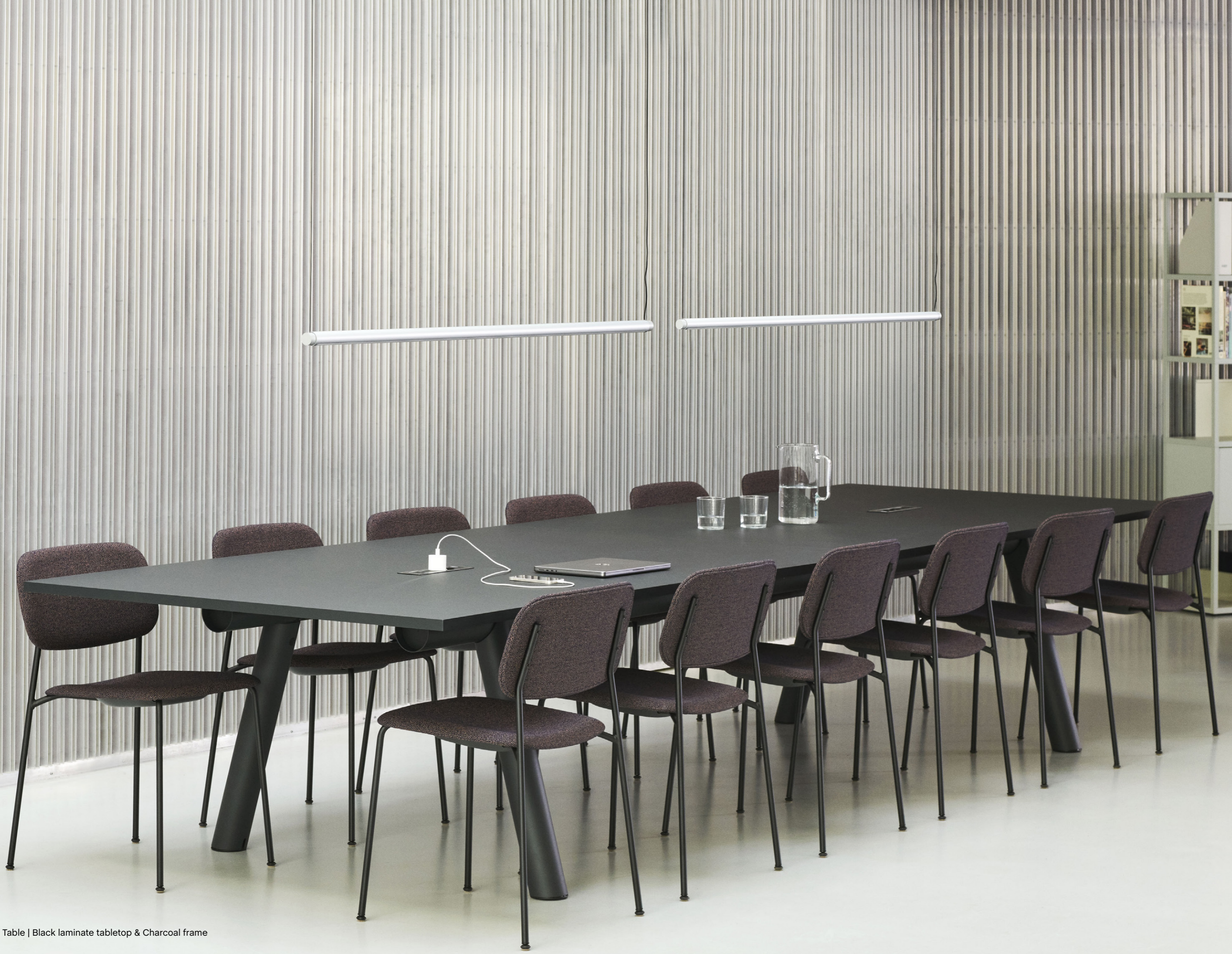
Boa Table | Black laminate tabletop & Charcoal frame