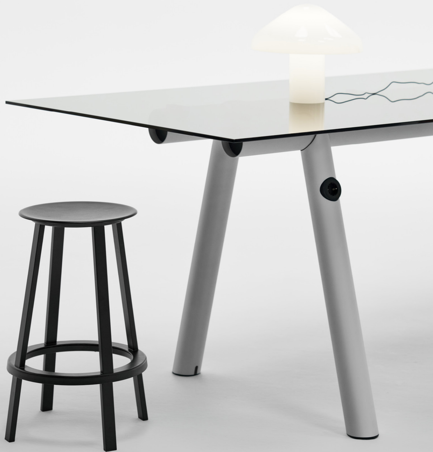
Boa Table High | Pix in leg | Grey glass tabletop & Metallic grey frame