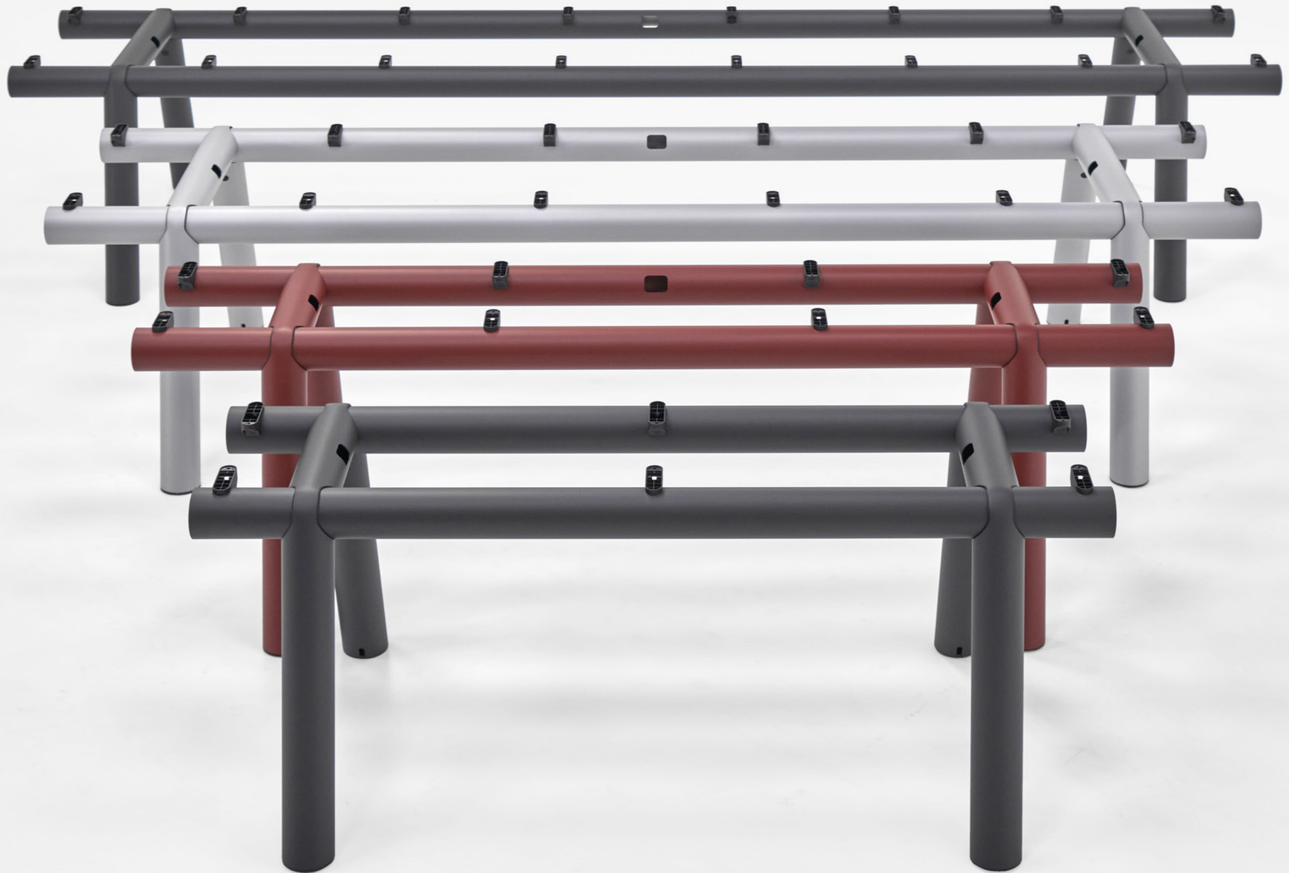
Boa Table Frame Family