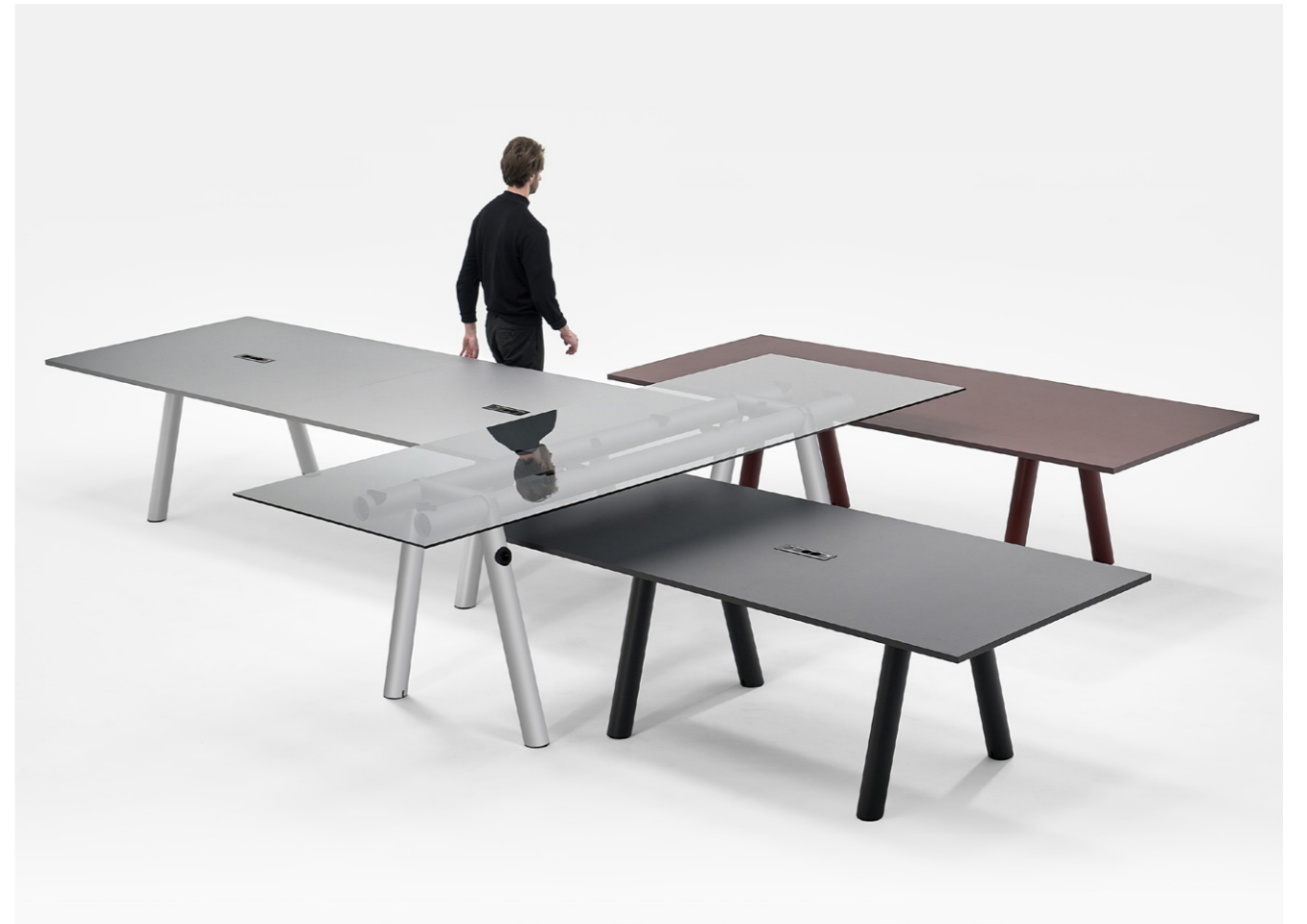
Boa Table Family