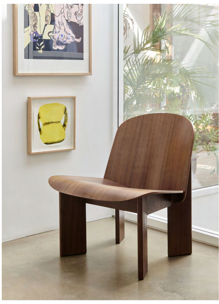
Chisel Lounge Chair | Walnut