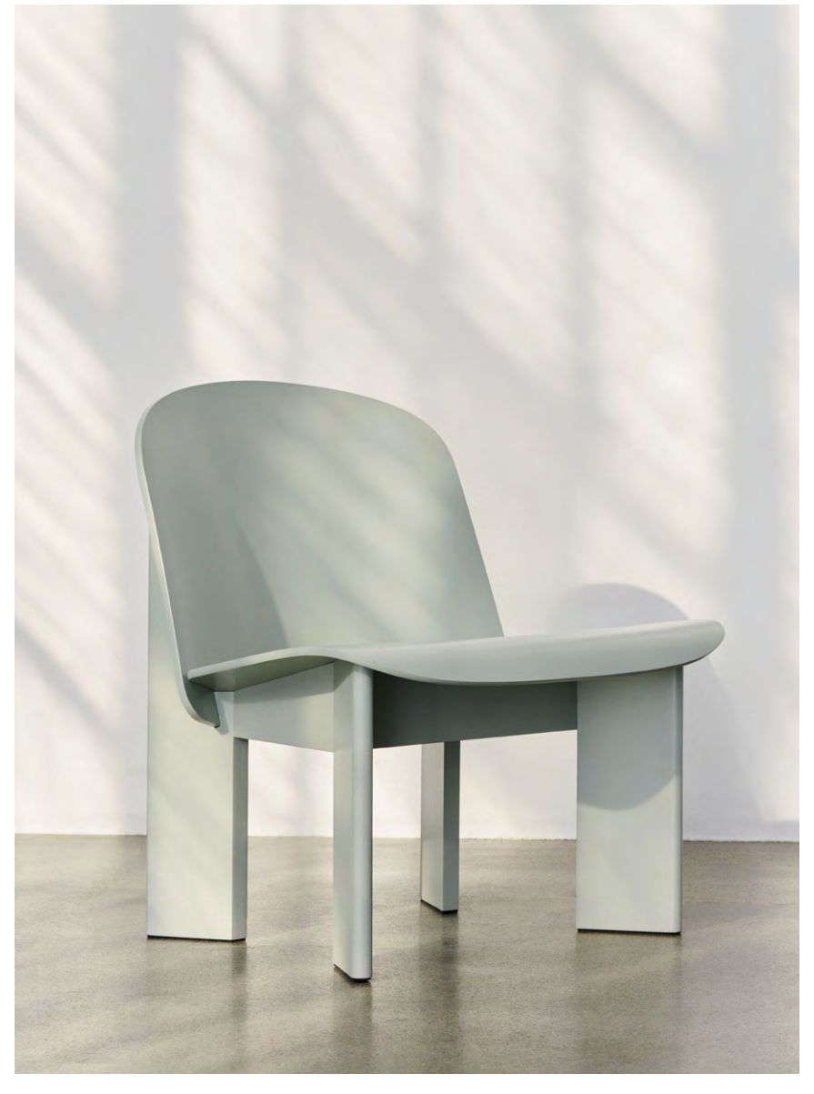
Chisel Lounge Chair | Eucalyptus