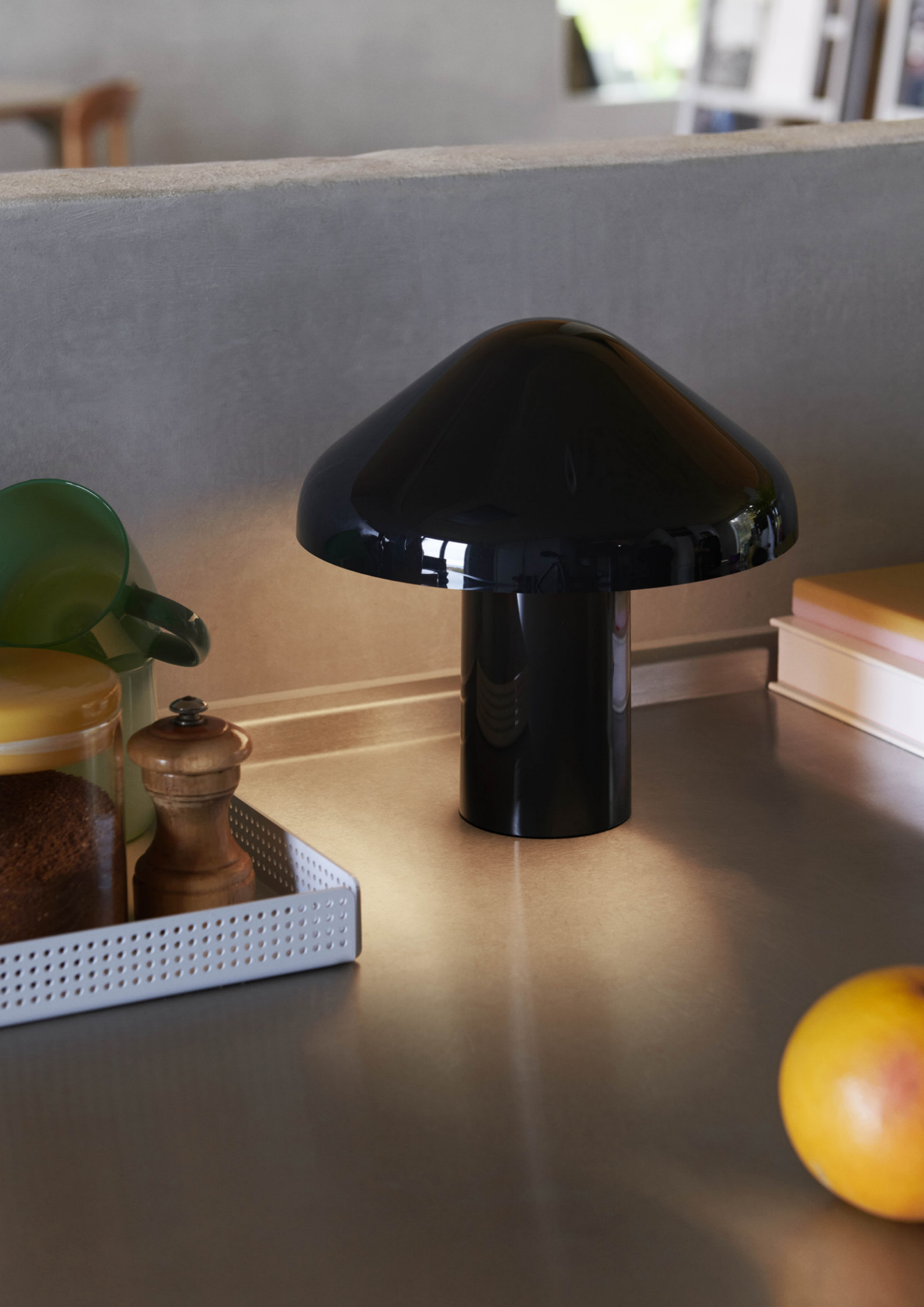
- PAO PORTABLE LAMP -