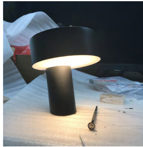
A cast iron weight creates stability in the base, whilst ensuring the tilted angle remains perfectly balanced.