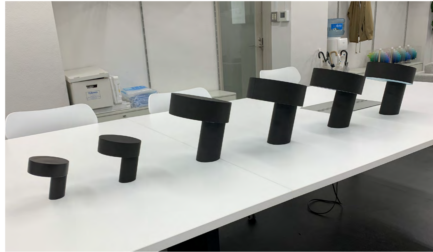
The lamp has a wet spray satin finish that creates a smooth surface, with the bulb concealed behind the lamp's acrylic diffuser.