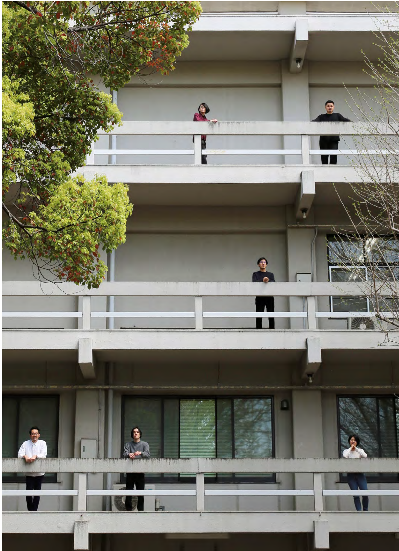
Team BRANCH at Tama Art University, located in western Tokyo.