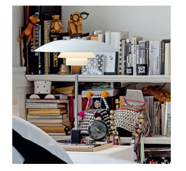
A private Residence TG

The fixture is designed based on the principle of a reflective three-shade system, which directs the light downwards. The shades are made of metal and painted white to ensure diffuse, comfortable light distribution.