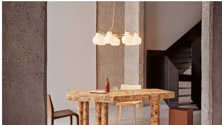
Set location - The Silo