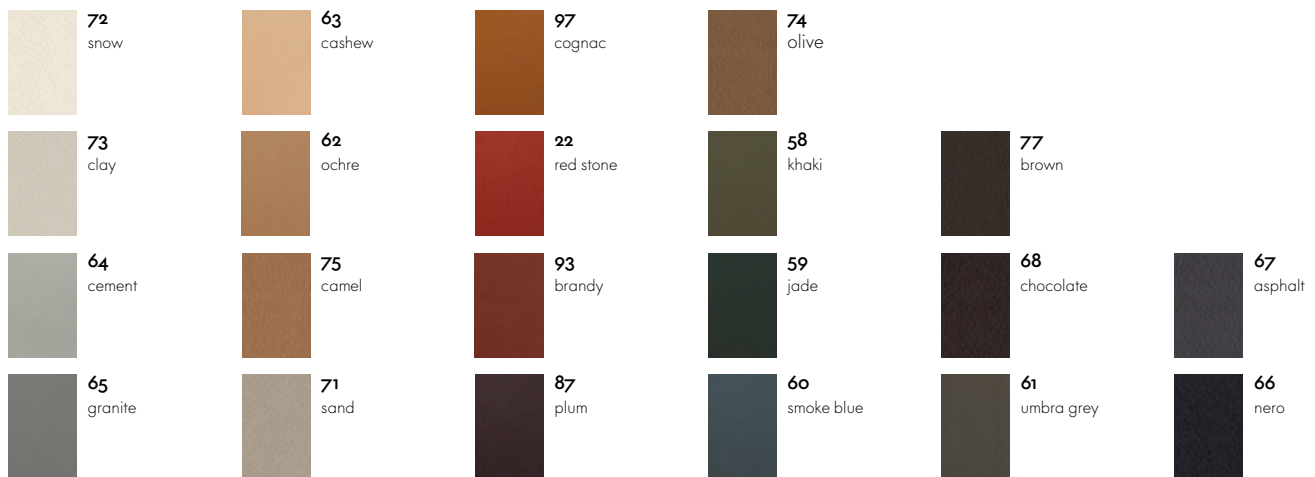
Seat shell Leather