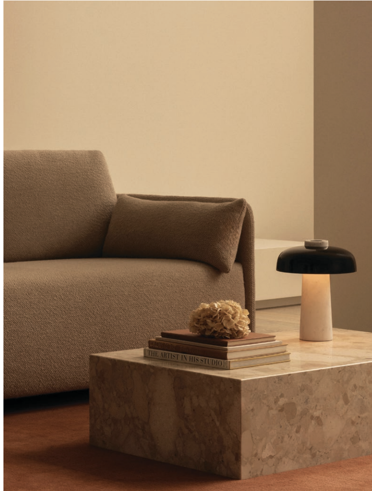
OFFSET SOFA BED Designed by Norm Architects