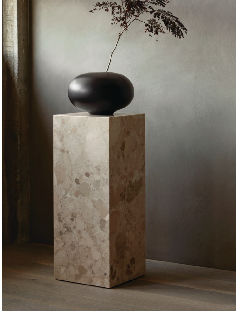
PLINTH PEDESTAL Designed by Norm Architects