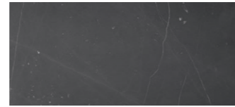
NERO MARQUINA MARBLE