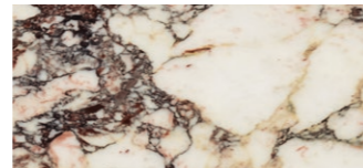
CALACATTA VIOLA MARBLE