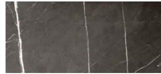
GREY KENDZO MARBLE