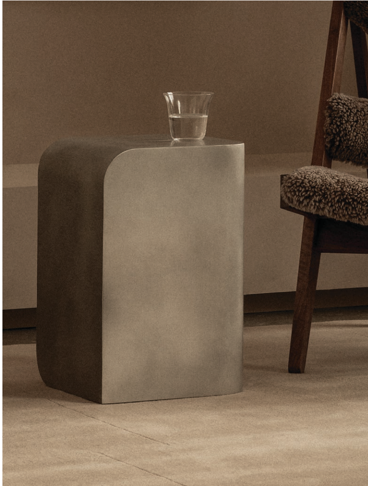
VOLUME SIDE TABLE Designed by Ted Synnott