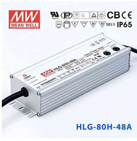
RF29208 HLG – 80H – 48A