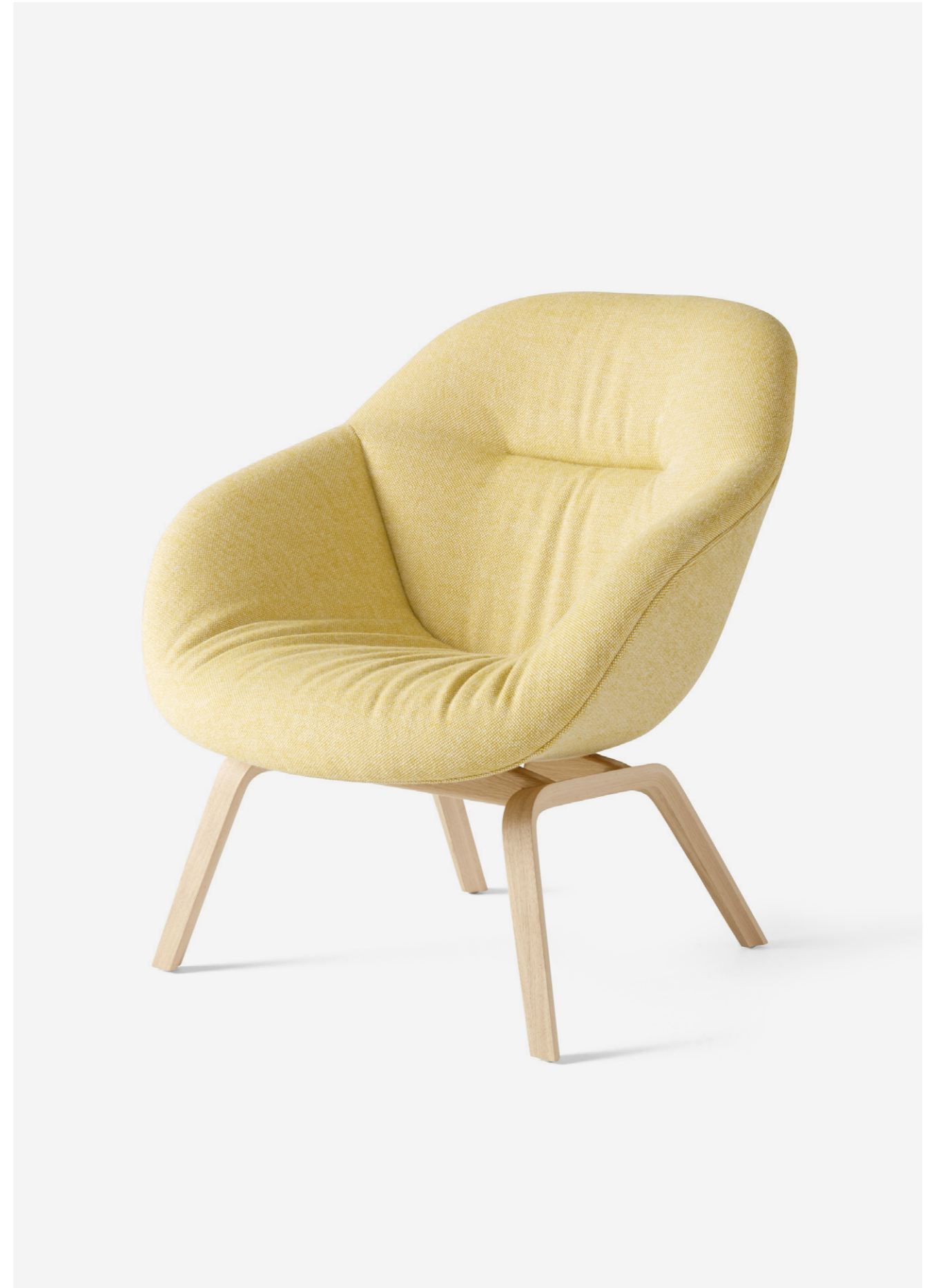
AAL 83 Soft | Hallingdal 407 | Water-based lacquered oak base

The AAL 83 Soft fuses the minimalist, more angular aesthetics of the moulded plywood frame with the softness and warmth of the quilted shell. Retaining the same compact body, shaped armrests, and simple, sculpted design that characterise the rest of the lounge series, this design features a solid base with angled legs that slant slightly outwards for optimal stability. The base is available in different finishes and the quilted shell is offered in a variety of upholstery options, providing a multitude of design combinations that give this series versatility in a wide range of corporate, public, and private contexts.