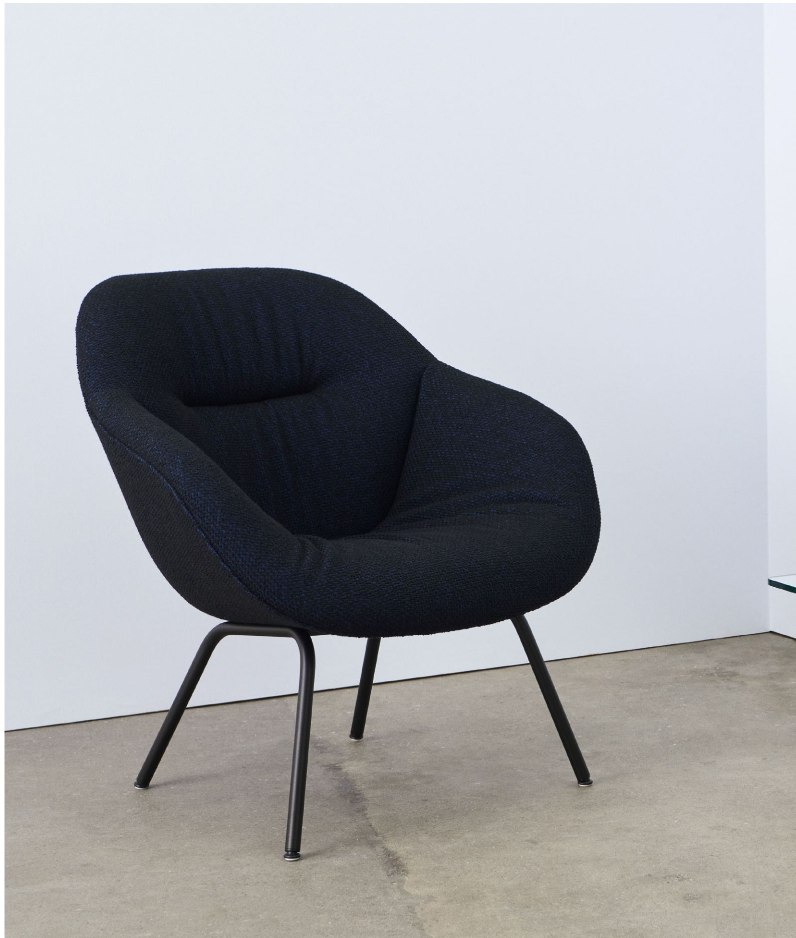
AAL 87 Soft | Tartaglia 871 | Black powder coated steel base