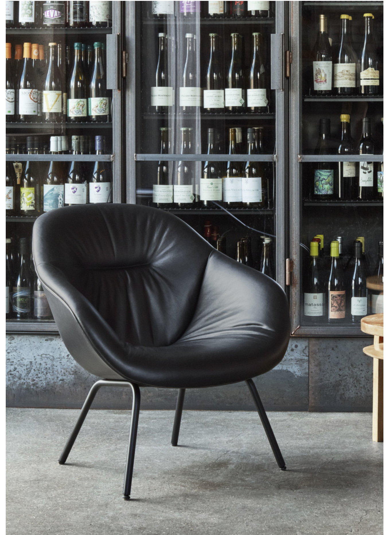
AAL 87 Soft | Sense black | Black powder coated steel base