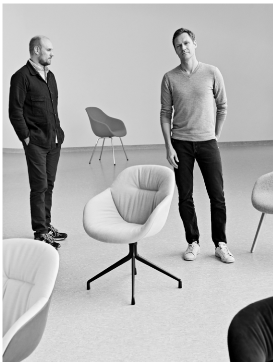
Hee Welling & HAY

The AAL 87 Soft fuses the sleek, elegant aesthetics of the four-legged steel frame with the softness and warmth of the quilted shell. Retaining the same compact body, shaped armrests, and simple, sculpted design that characterise the rest of the lounge series, this design features a functional base with slim, angled legs that slant slightly outwards for optimal stability. The base is available in chrome and powder-coated steel and the quilted shell is offered in a variety of upholstery options, providing a multitude of design combinations that give this series versatility in a wide range of corporate, public, and private contexts.