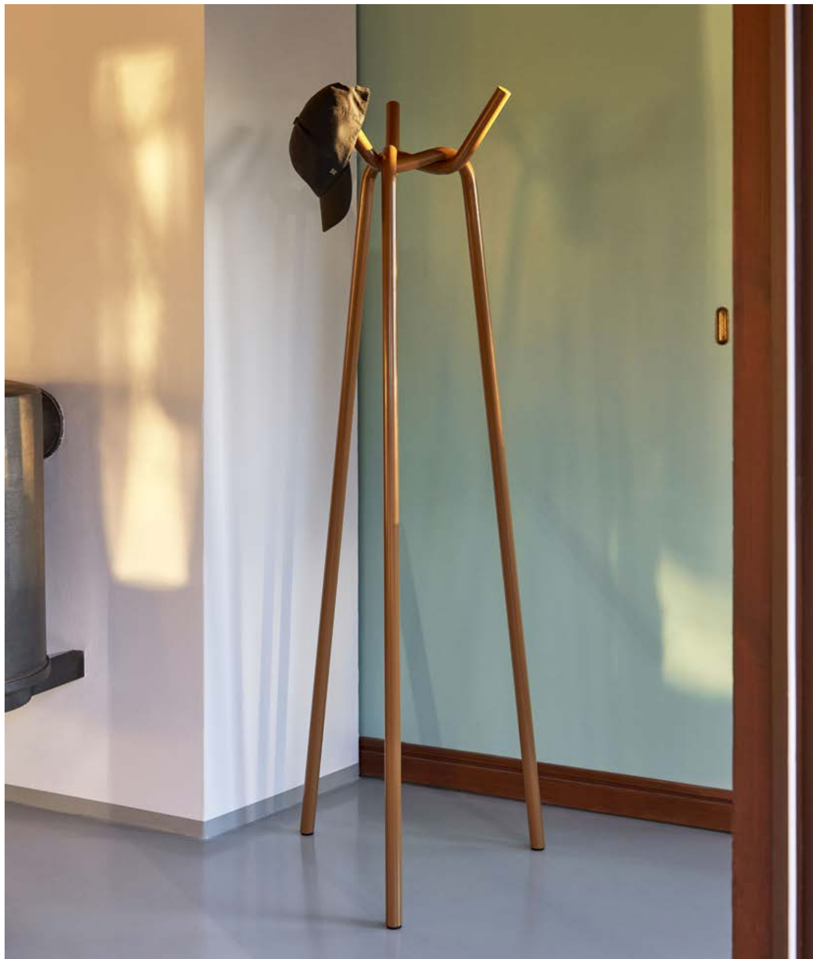
Knit | Toffee powder coated steel