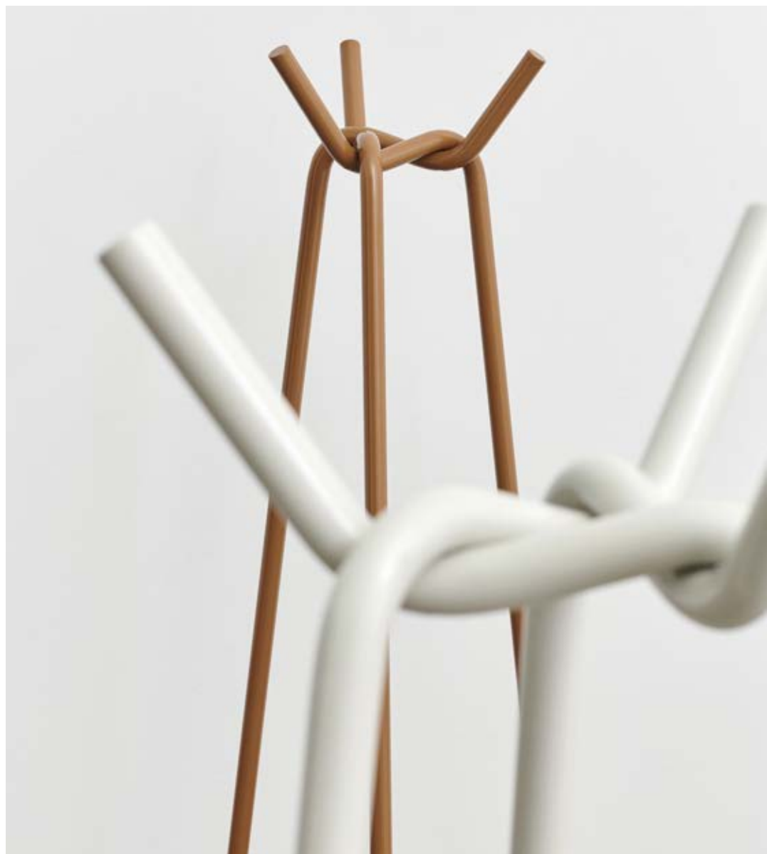
Knit | White powder coated steel Knit | Toffee powder coated steel