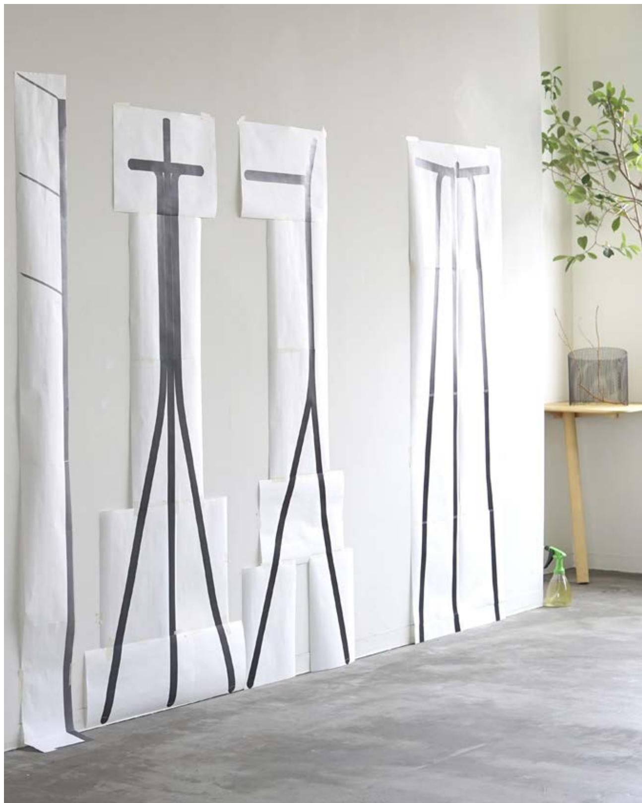
The three metal pipes are connected in a three-dimensional way so that they support each other.