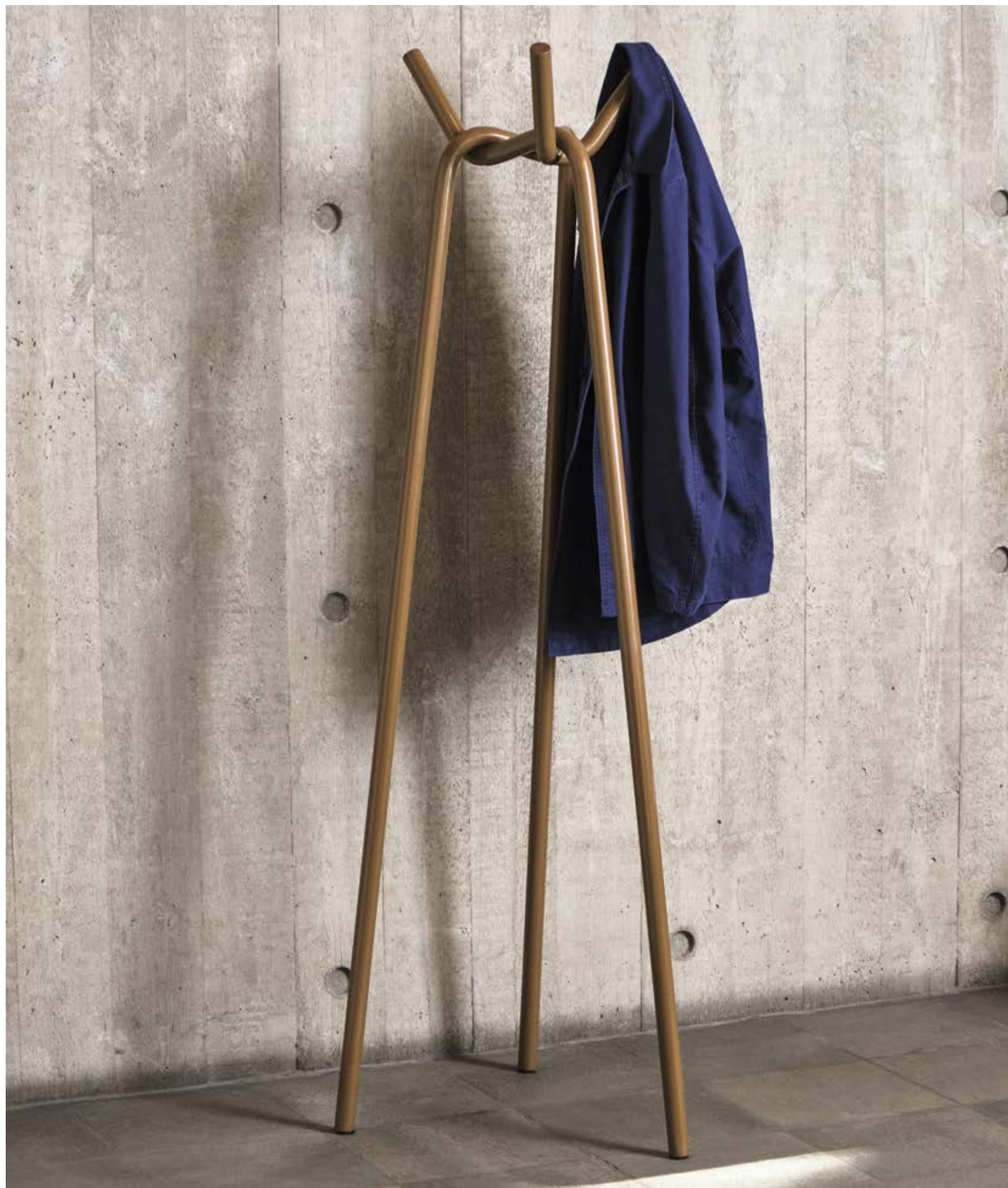
Knit | Toffee powder coated steel