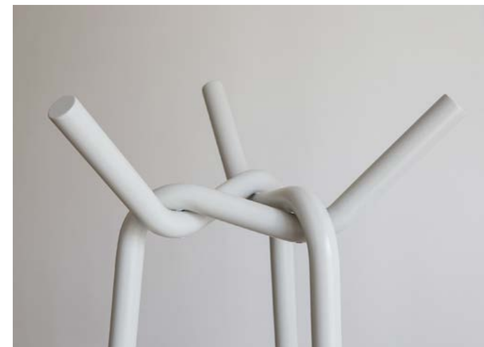
Jin uses the practical process of creating designs by hand while touching materials, creating Knit when experimenting with bending and knitting ropes and metal rods.