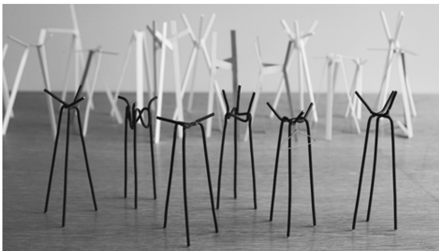
The unique shape of the structure is the feature of the design.