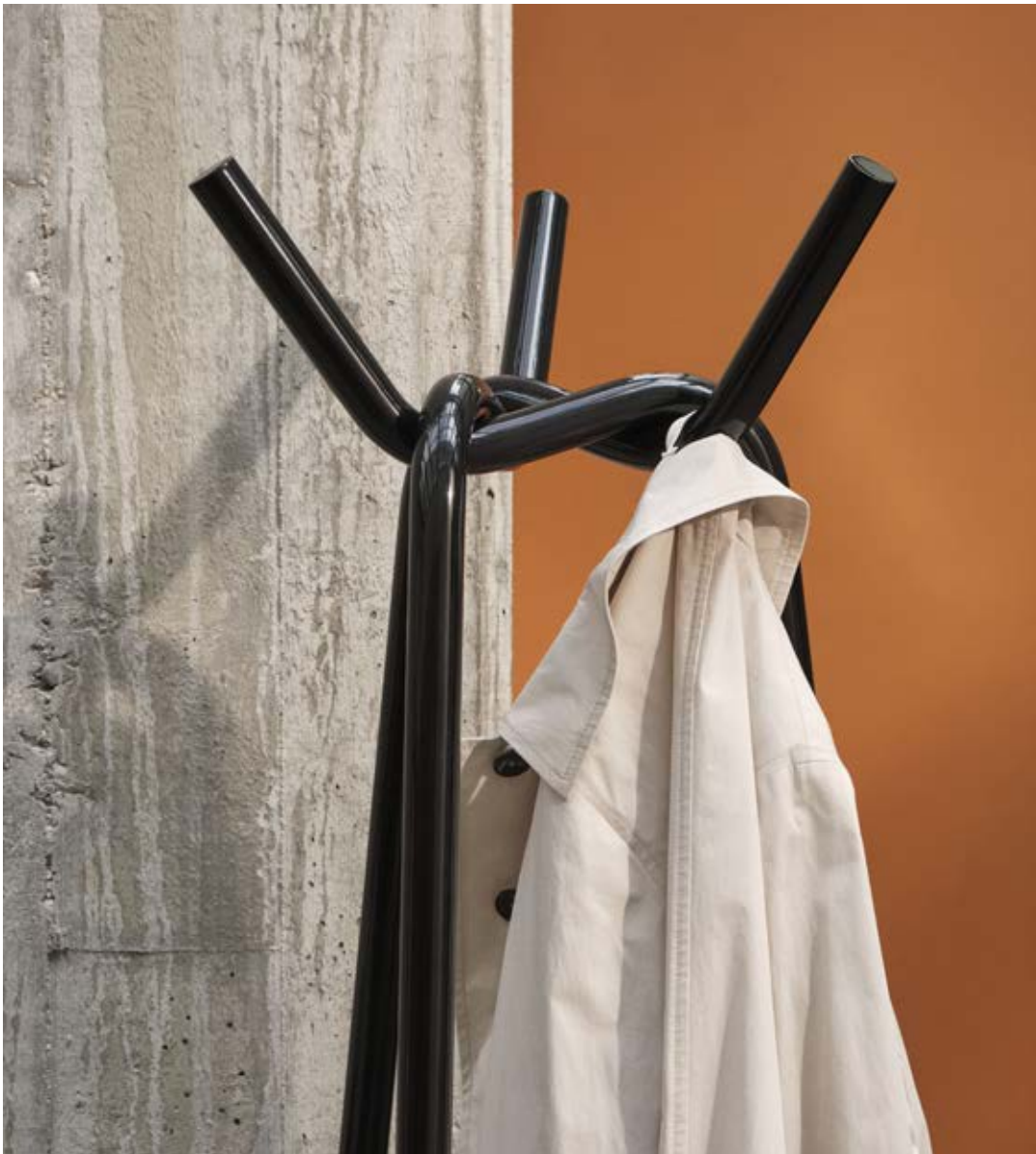
Knit | Black powder coated steel