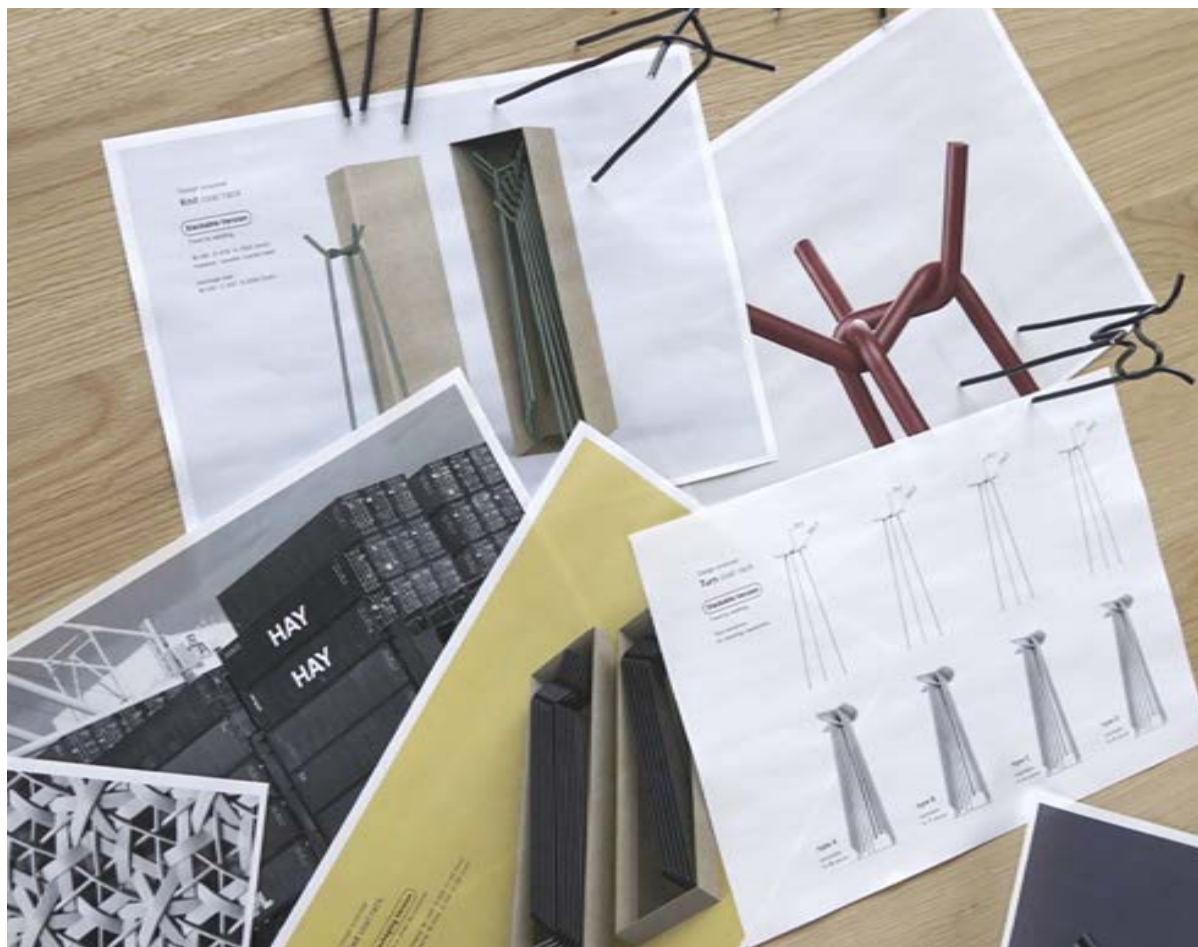
Jin's design process considered delivery and transportation when developing Knit.

Knit is a simple and iconic coat rack that can be used in a variety of ways.