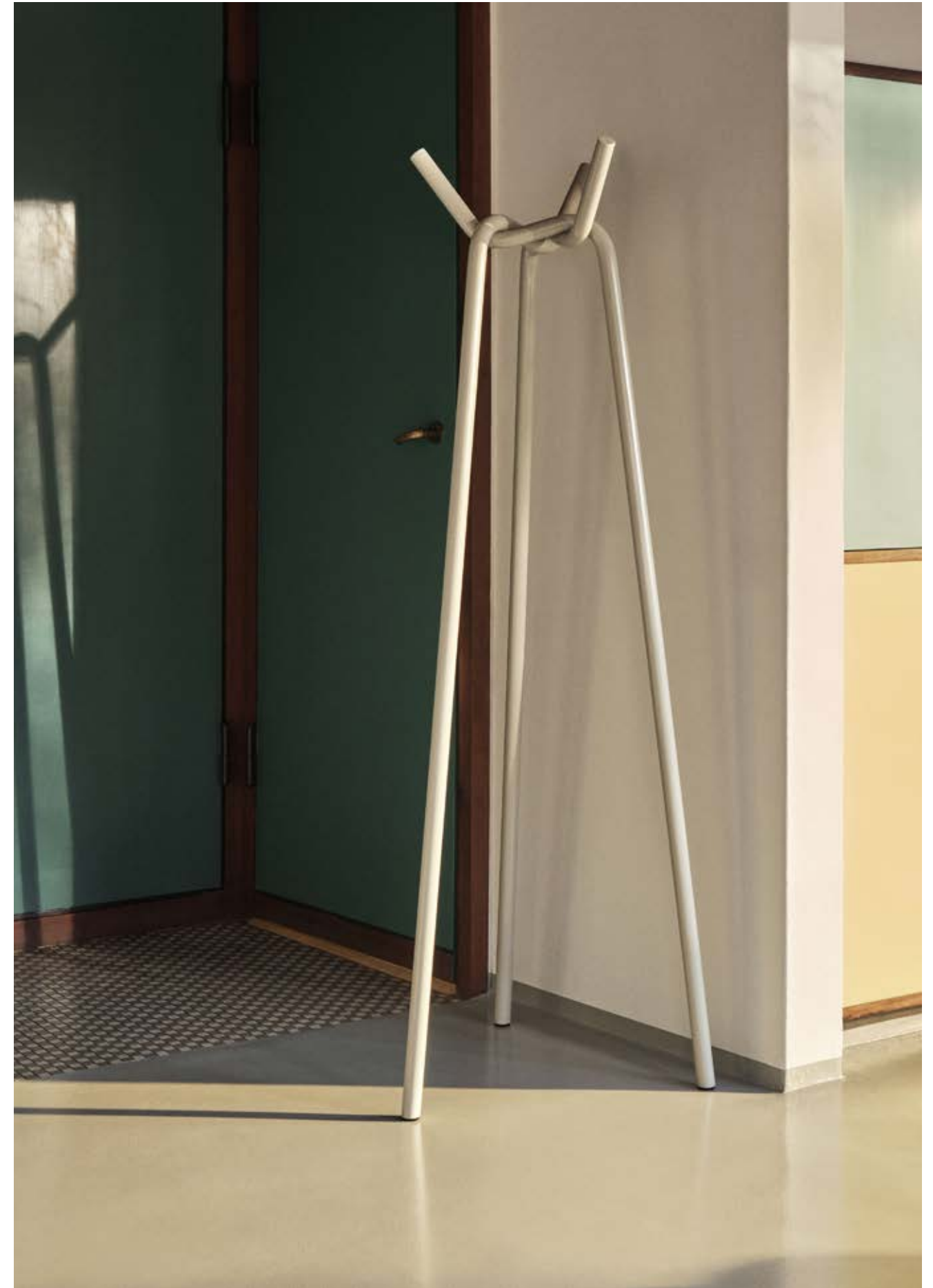
Knit | White powder coated steel