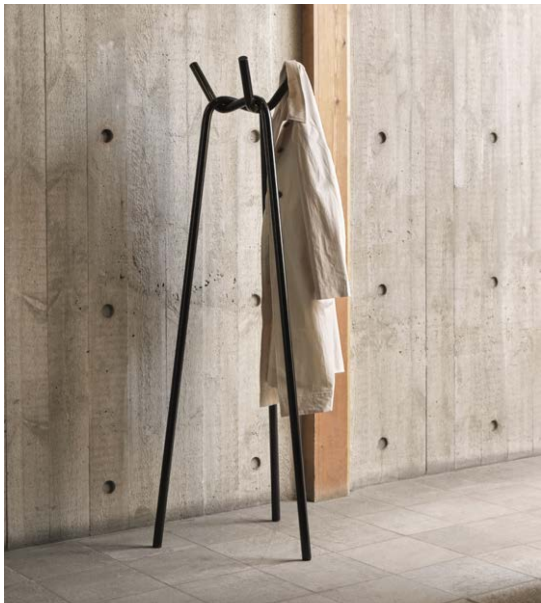
Knit | Black powder coated steel