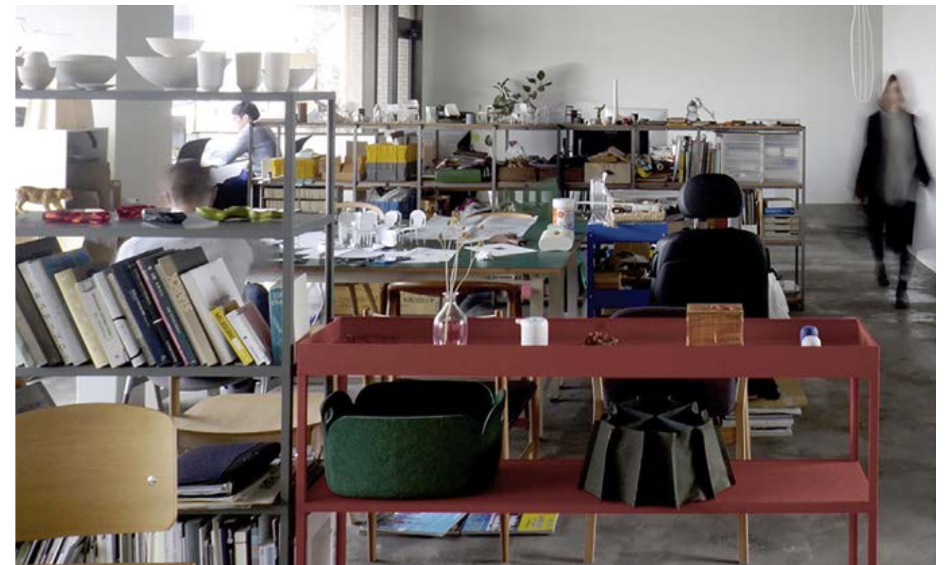
Jin Kuramoto's design studio in Tokyo, Japan.