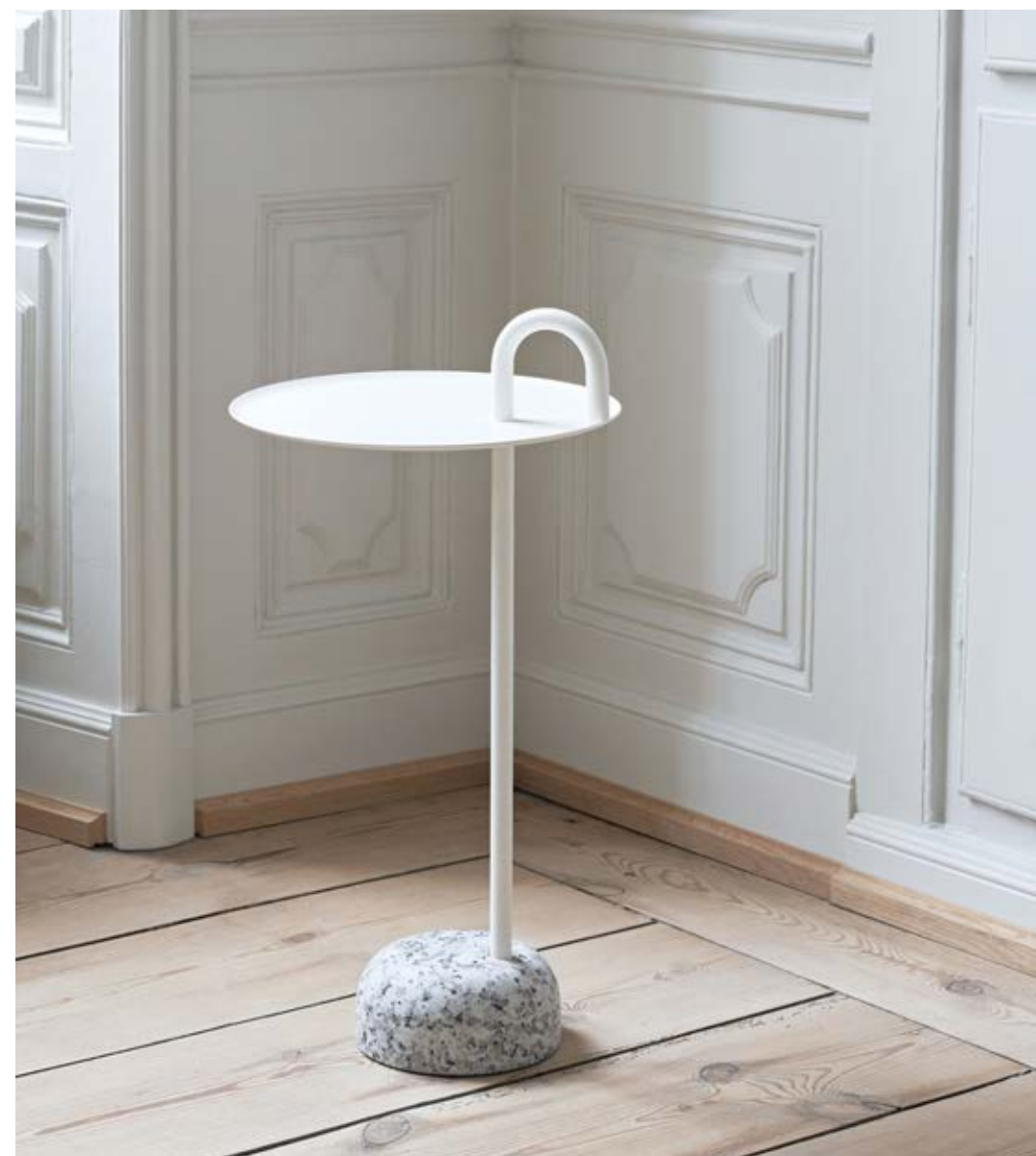
Bowler | Cream white