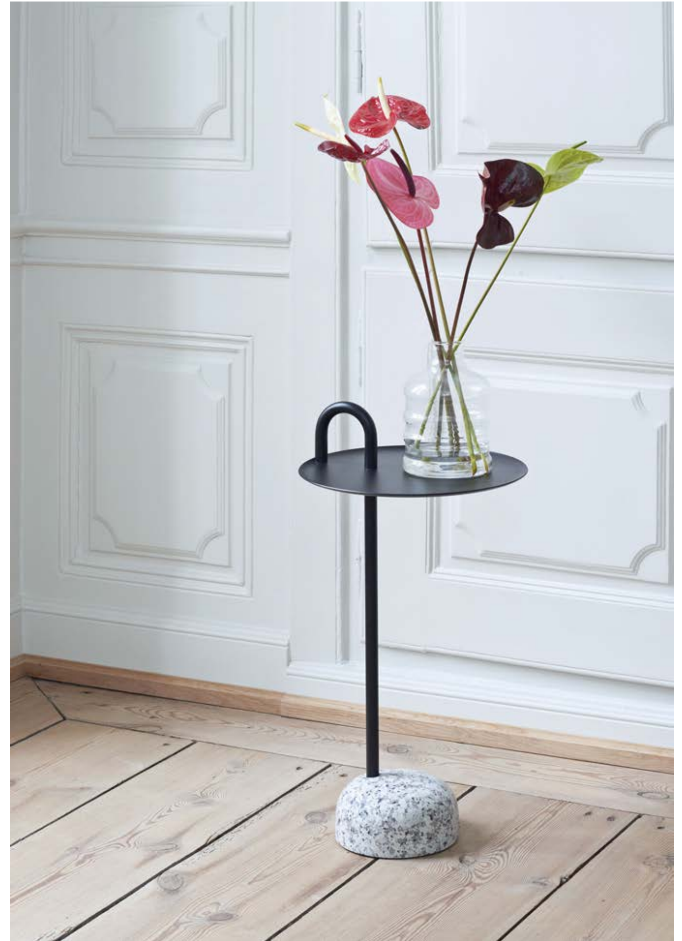
Bowler | Black