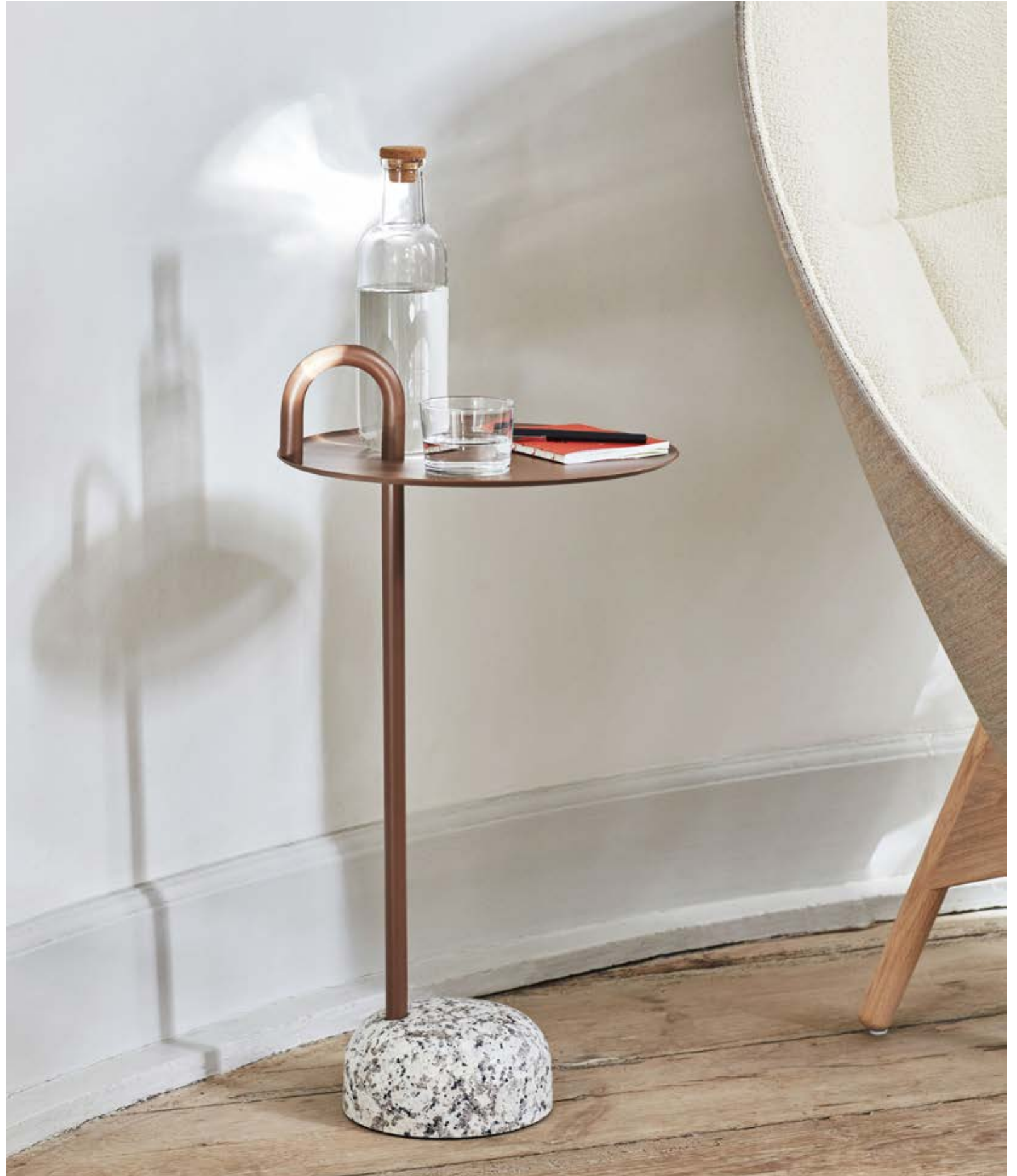
Bowler | Pale brown