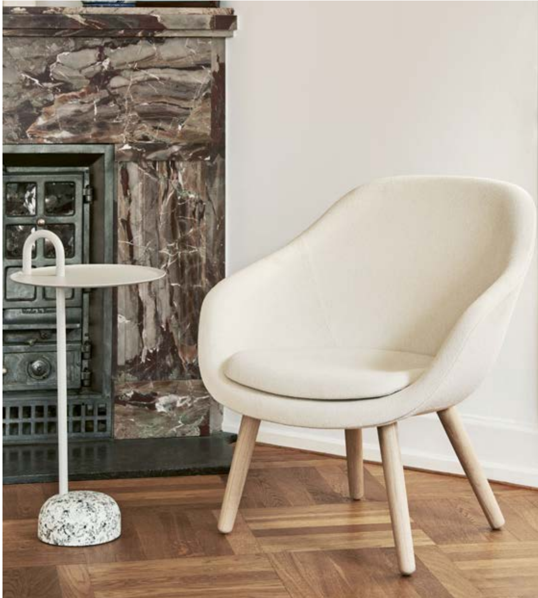
Bowler | Cream white