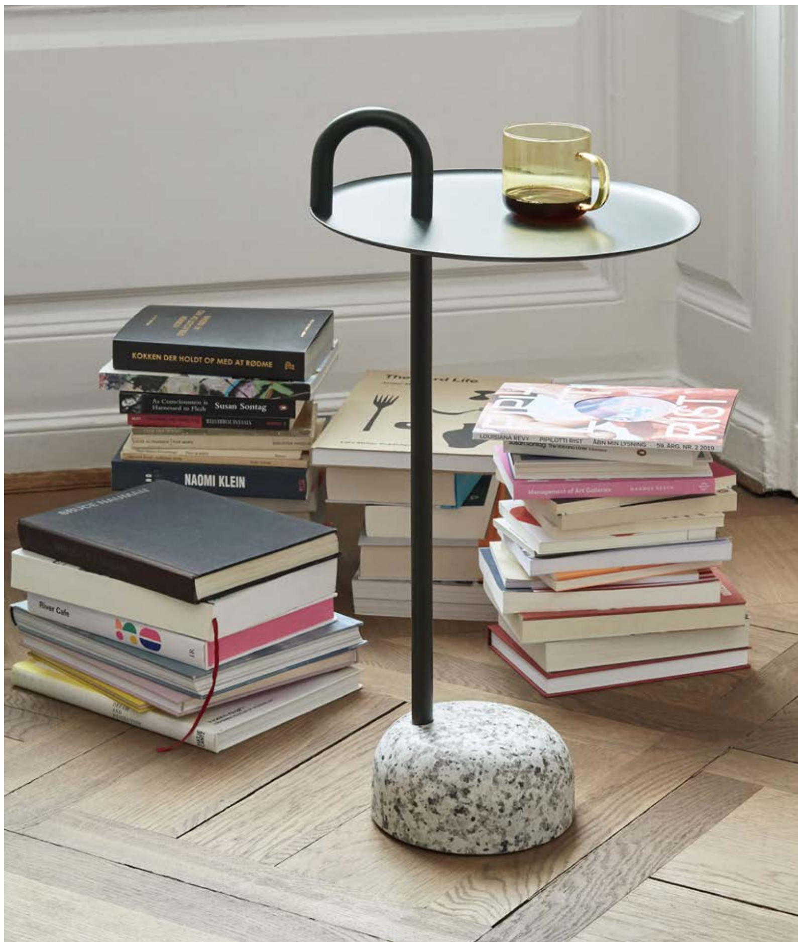
Bowler | Fir green