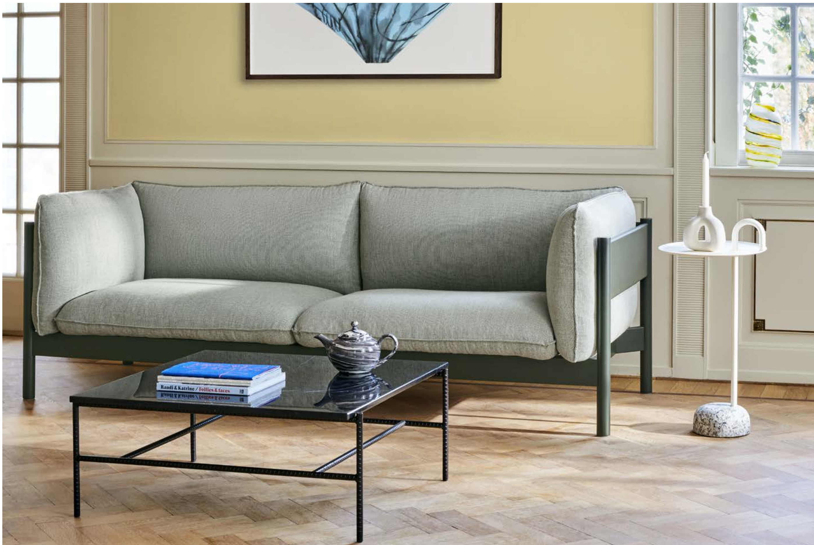
Bowler | White