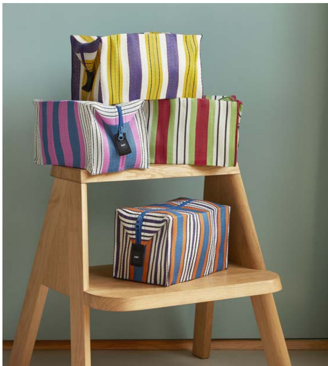
Butler | Oiled oak