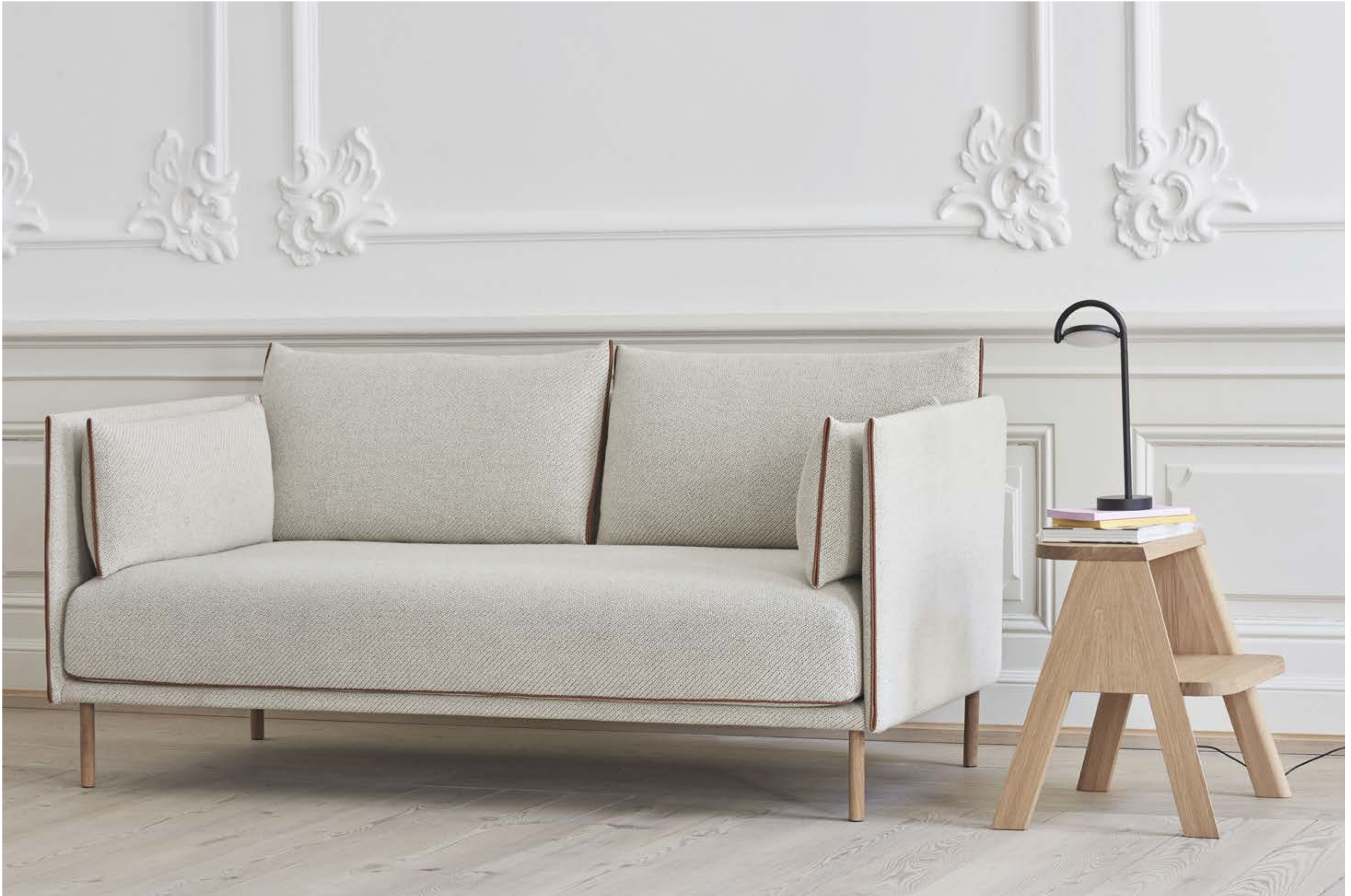
Butler | Oiled oak