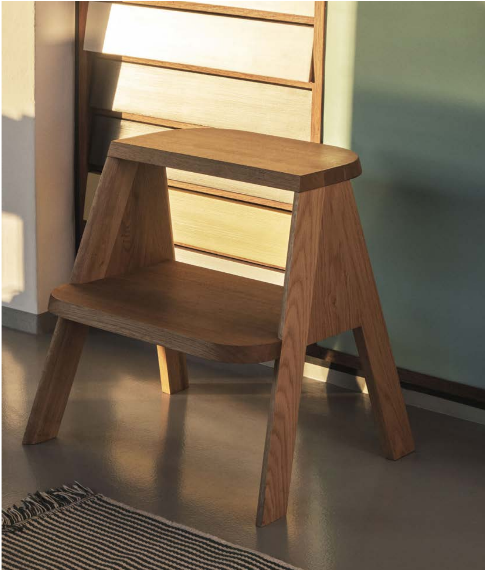
Butler | Oiled oak