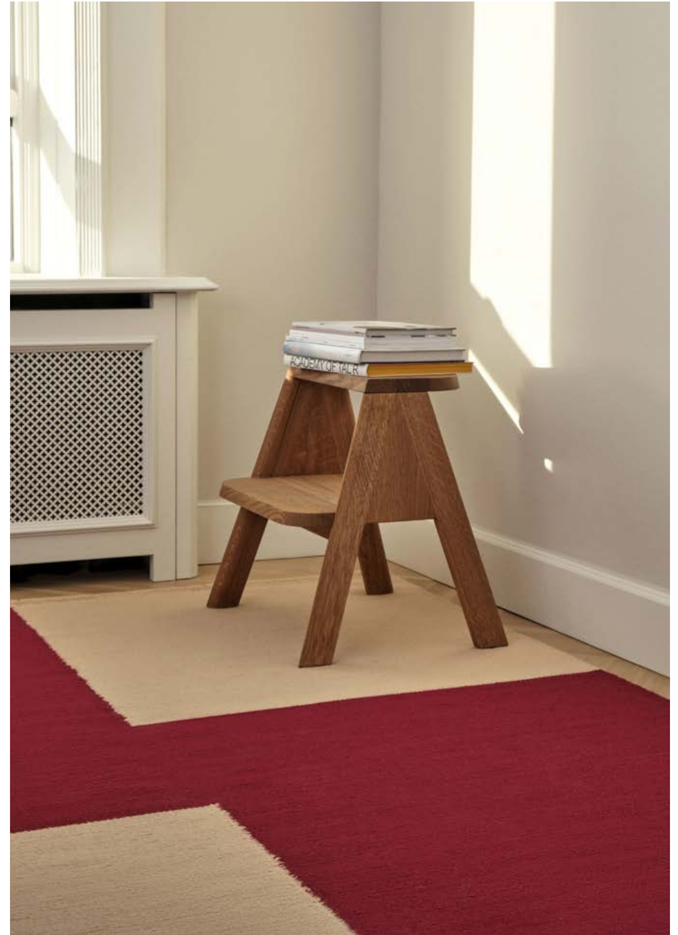
Butler | Oiled oak