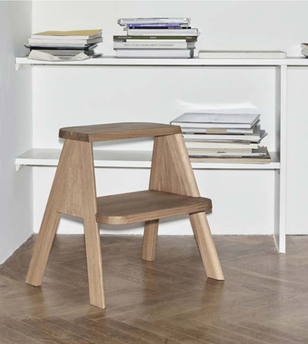
Butler | Oiled oak