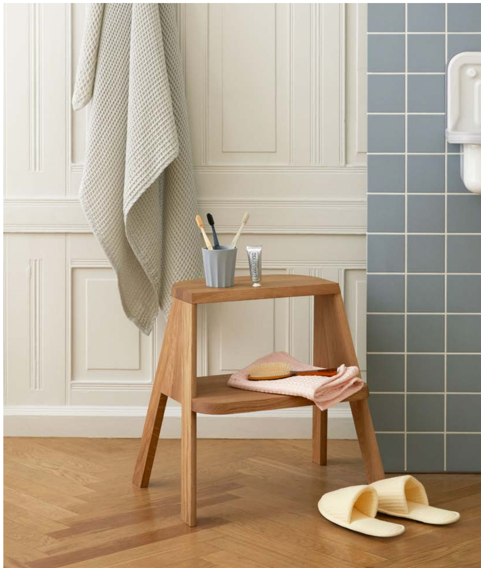
Butler | Oiled oak