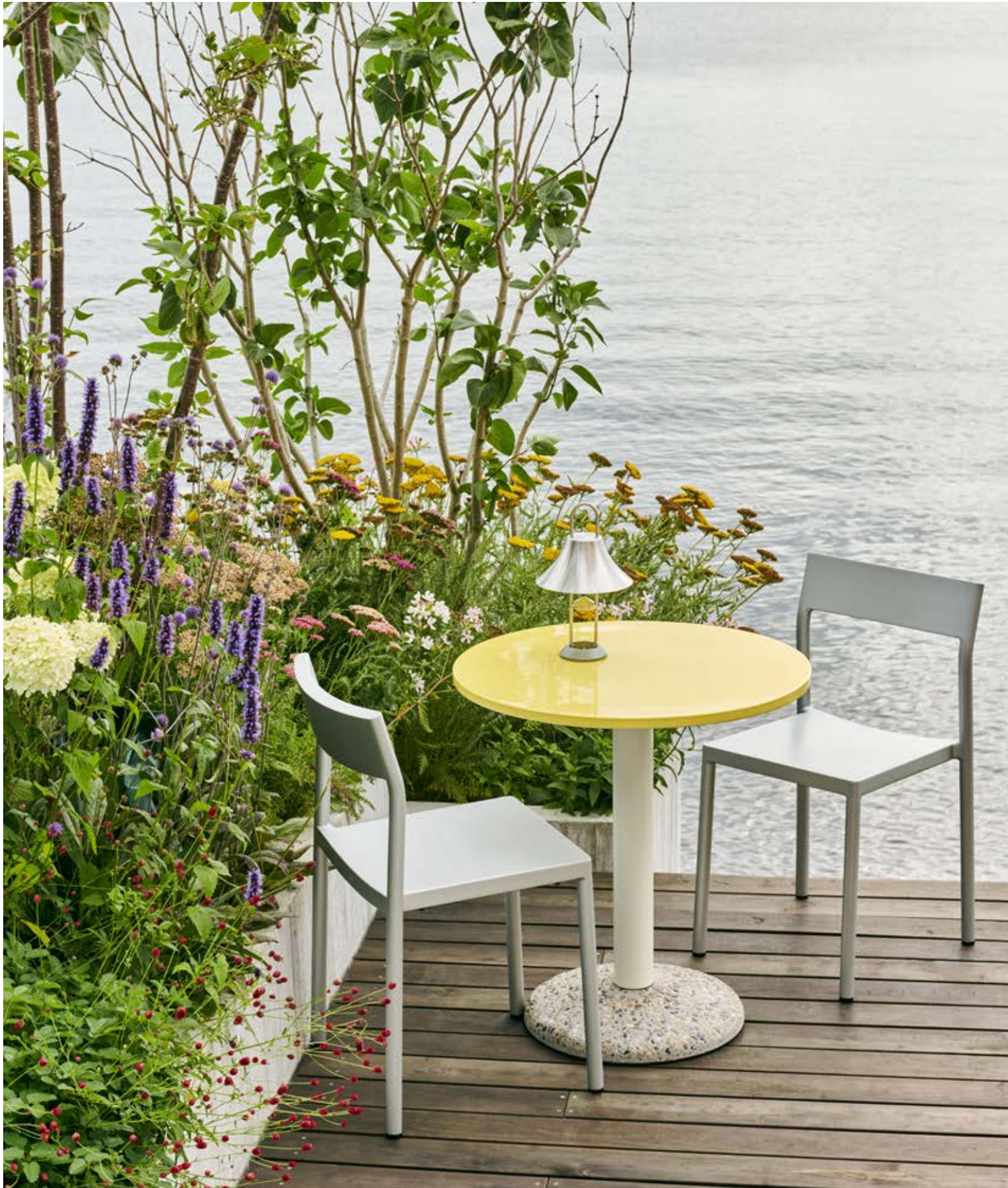
Ceramic Table | Bright yellow