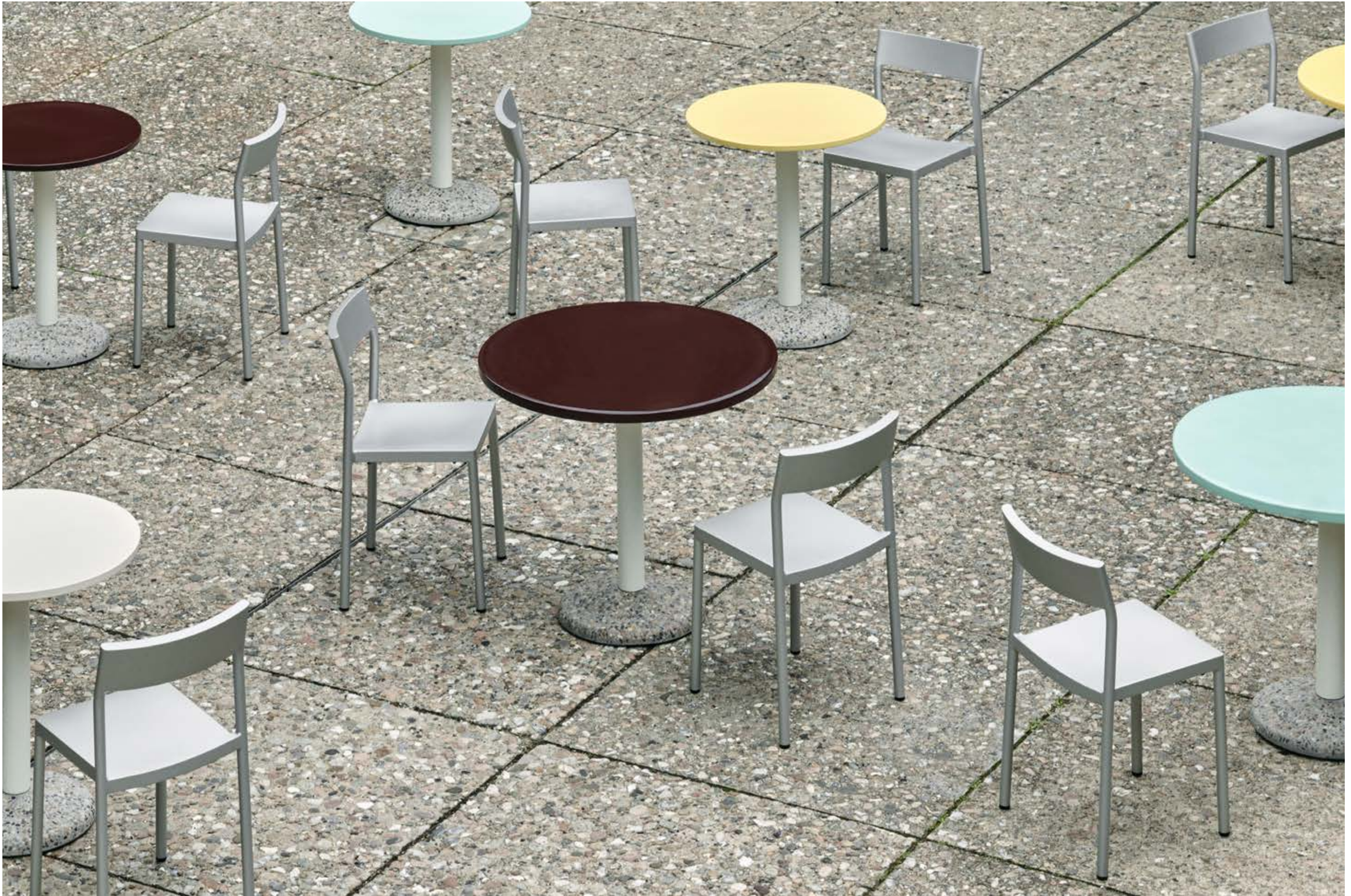
Ceramic Table family