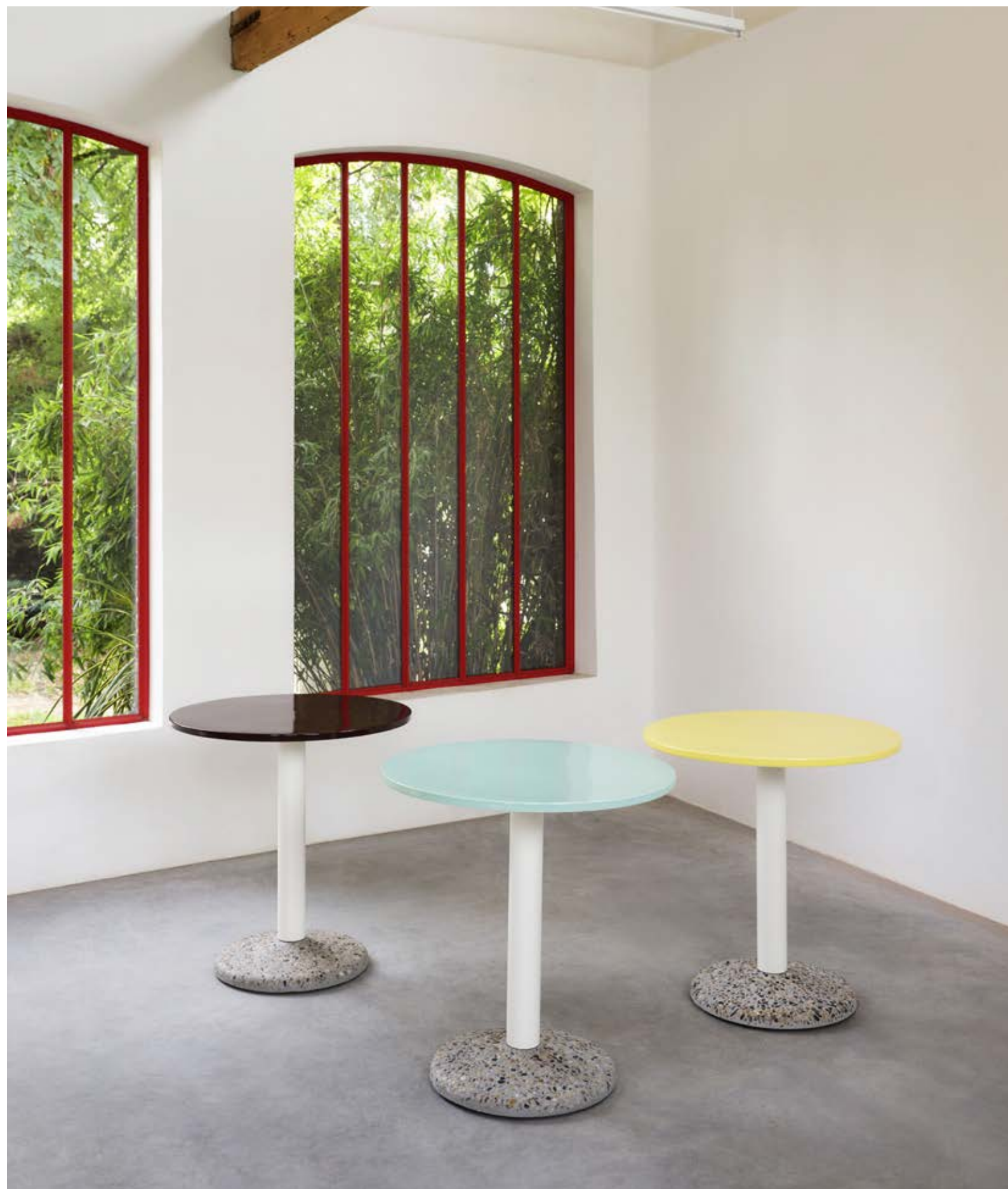
Ceramic Table family