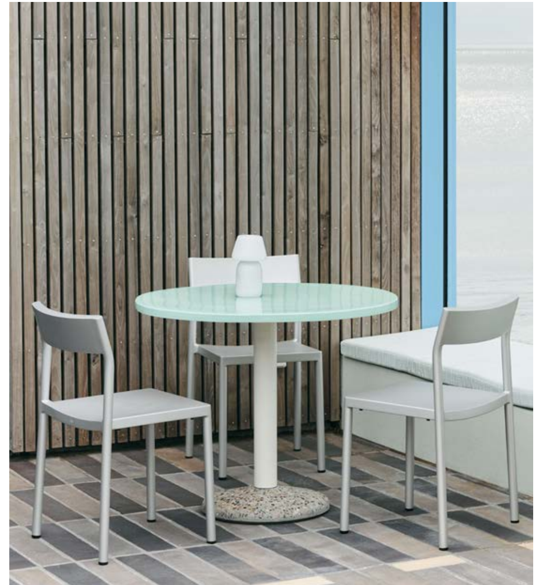
Ceramic Table | Light mint