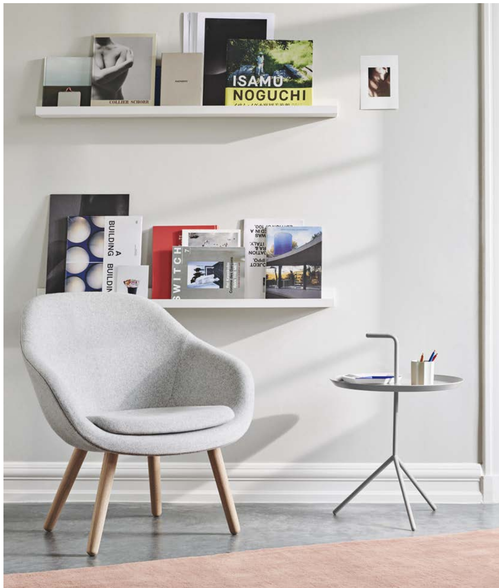
DLM | Grey