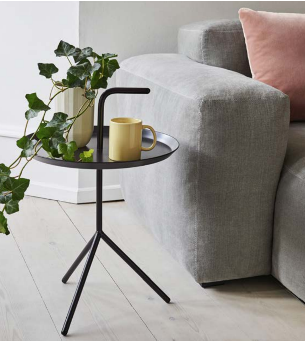
DLM | Black