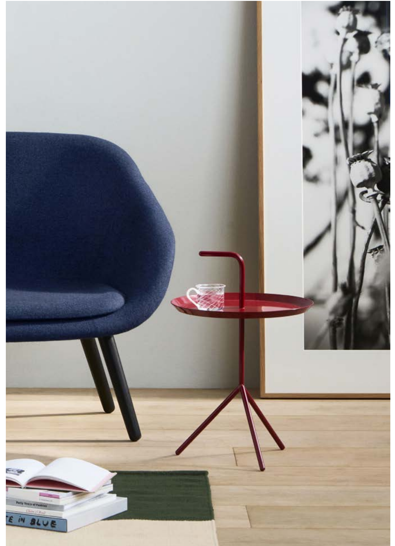
DLM | Cherry red high gloss