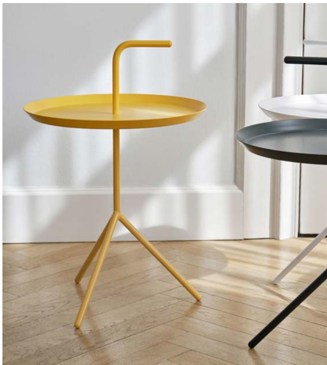
DLM | Sun yellow