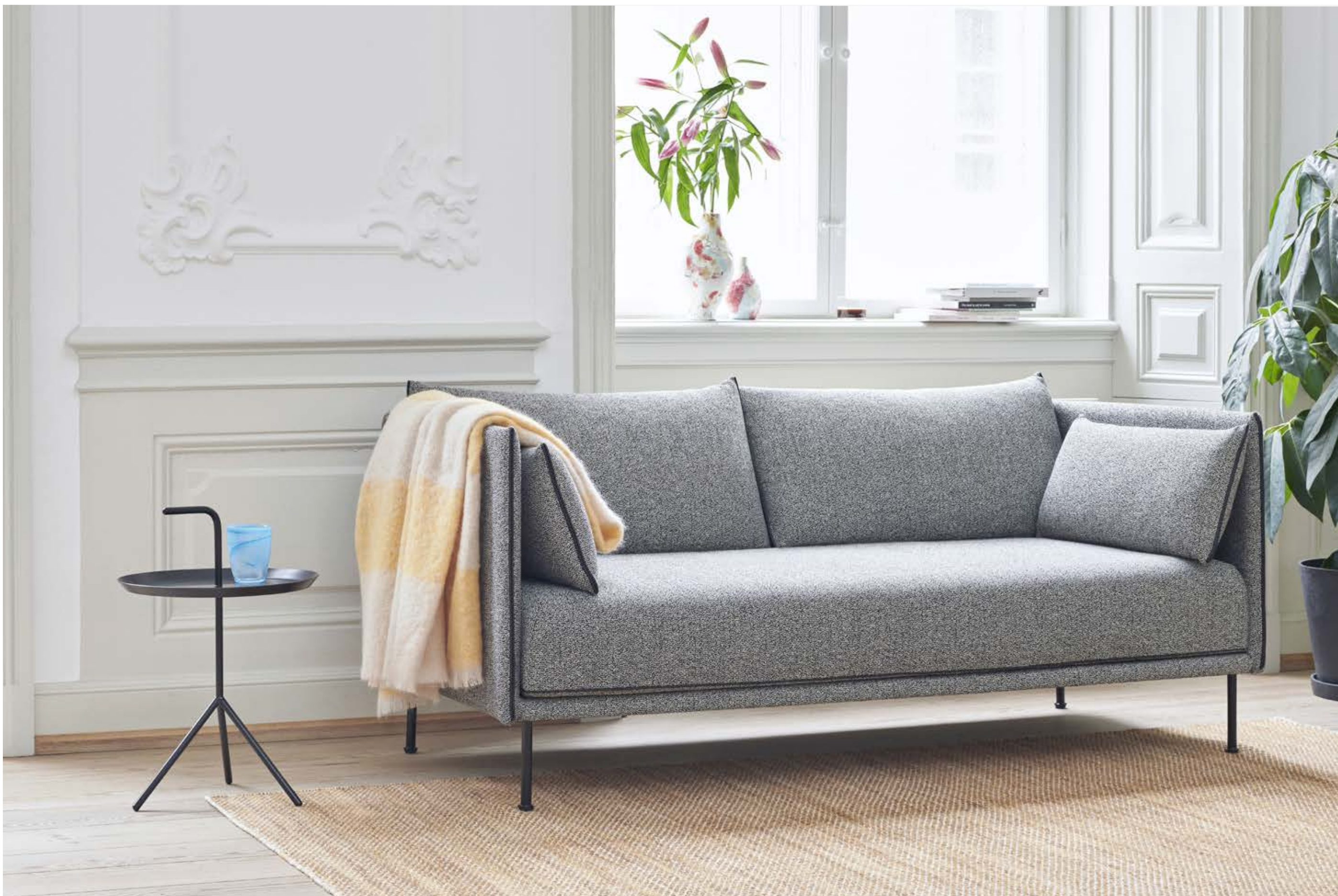
DLM | Black