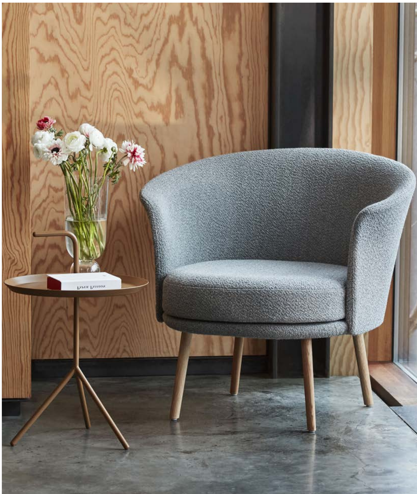
DLM | Toffee