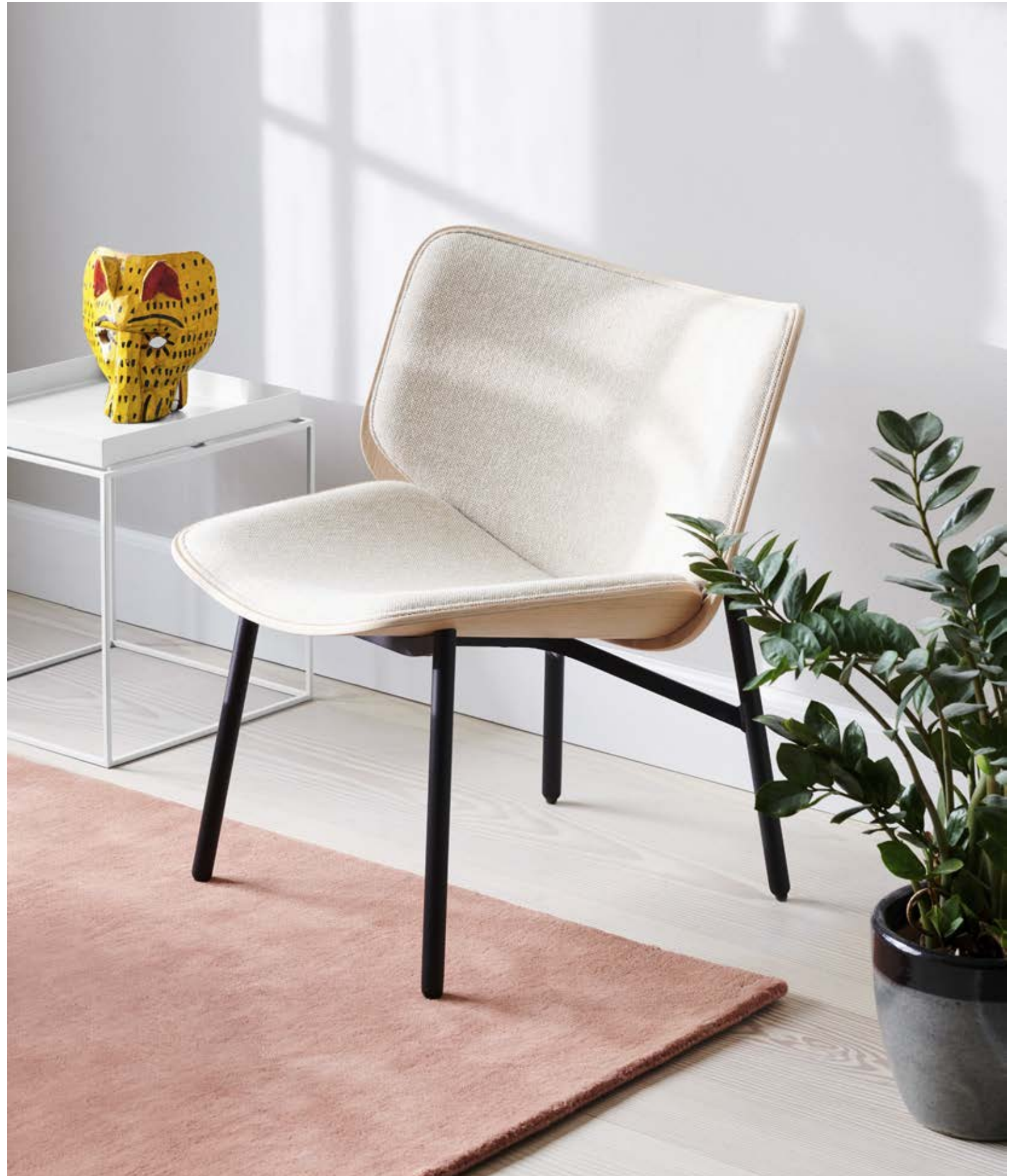
Dapper | Water-based lacquered oak shell | Uph Hallingdal 220 | Black powder coated steel base