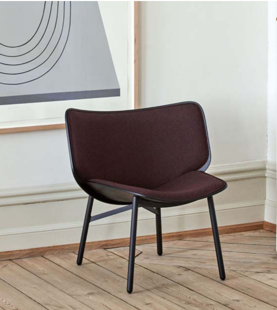
Dapper | Black water-based lacquered oak shell | Uph Olavi by HAY 14 | Black powder coated steel base