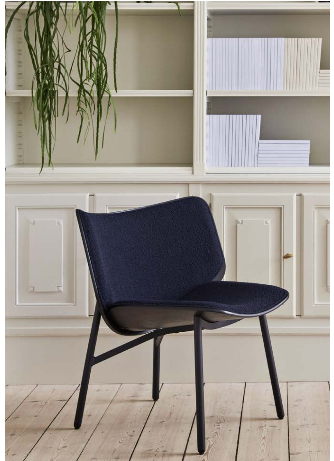
Dapper | Black water-based lacquered oak shell | Uph Flamiber dark blue J4 | Black powder coated steel base