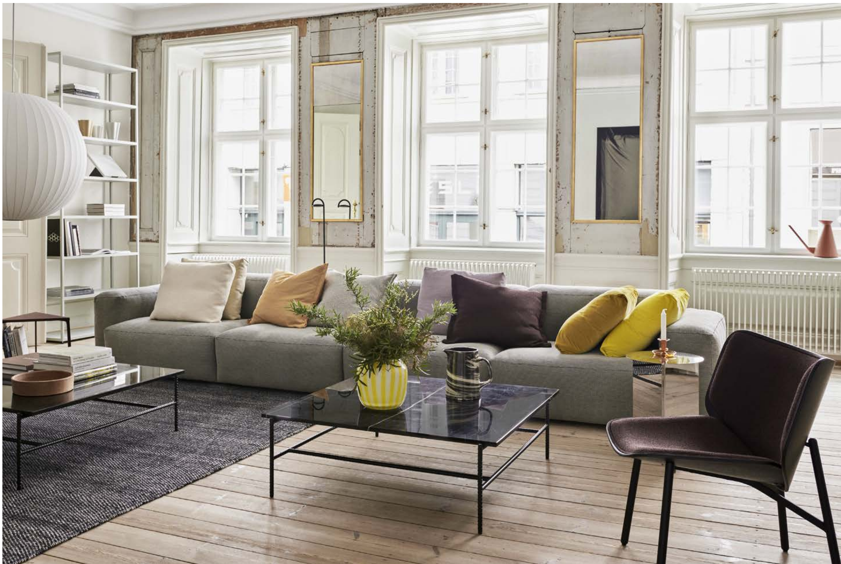
Dapper | Black water-based lacquered oak shell | Uph Olavi by HAY 14 | Black powder coated steel base