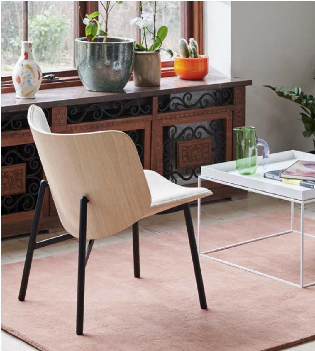
Dapper | Water-based lacquered oak shell | Uph Hallingdal 220 | Black powder coated steel base