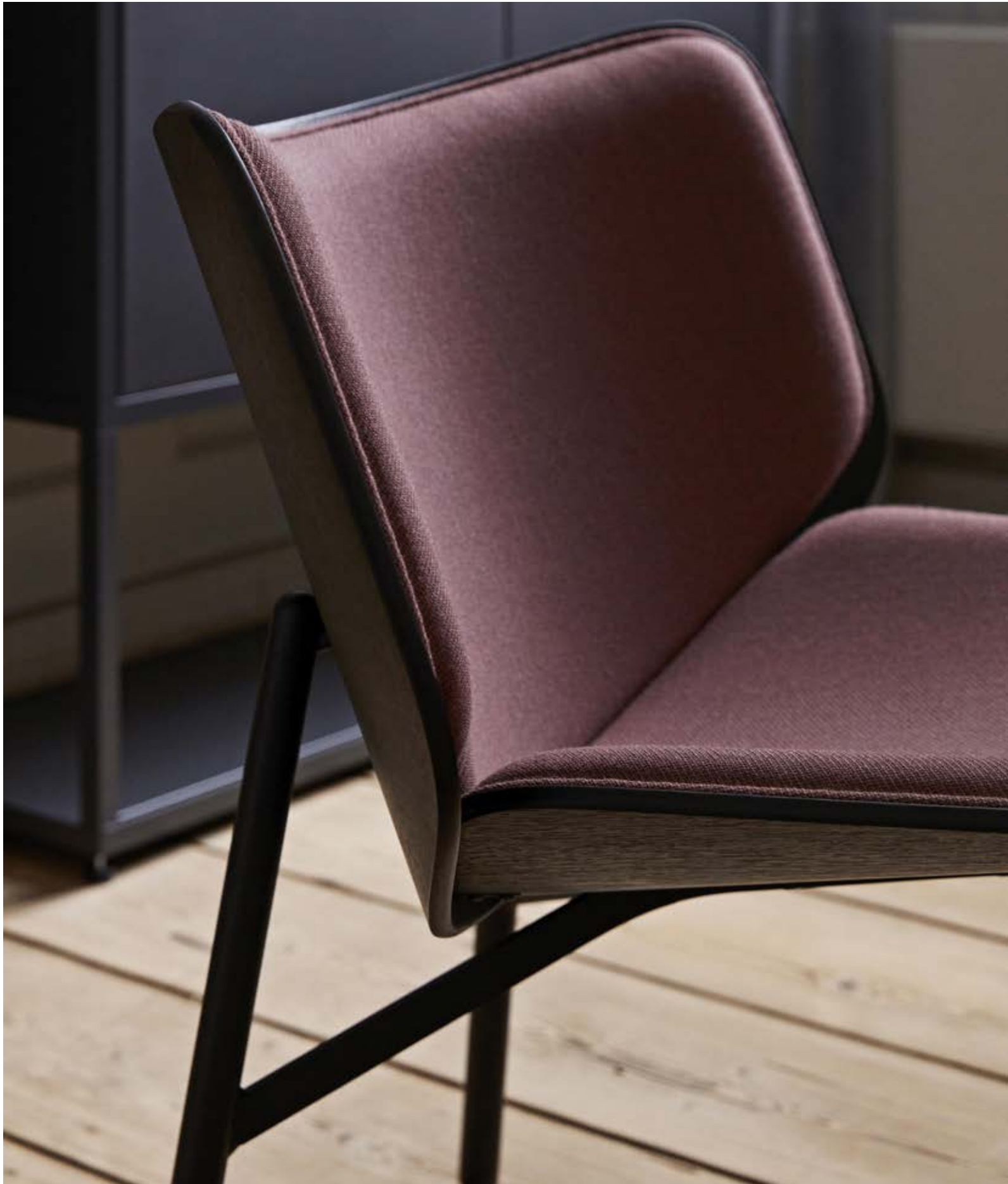
Dapper | Black water-based lacquered oak shell | Uph Olavi by HAY 14 | Black powder coated steel base