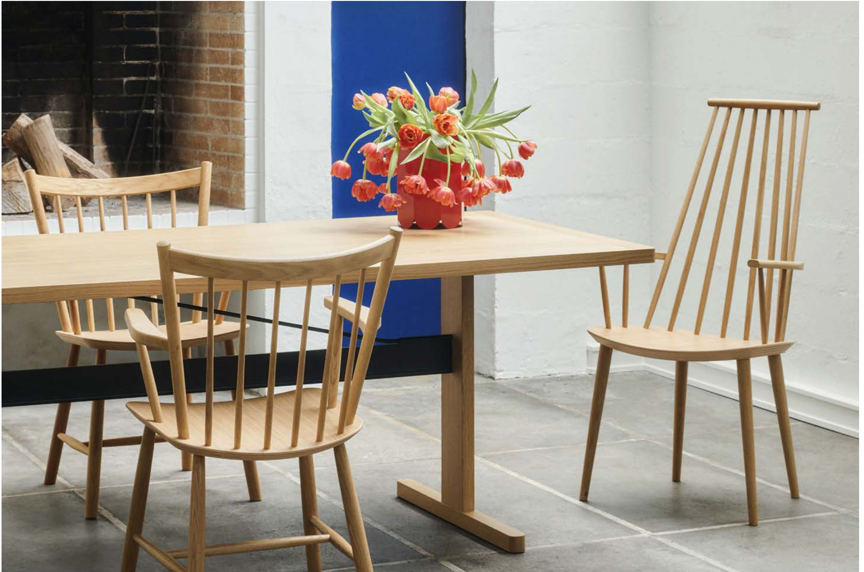
J110 Chair | Water-based lacquered oak