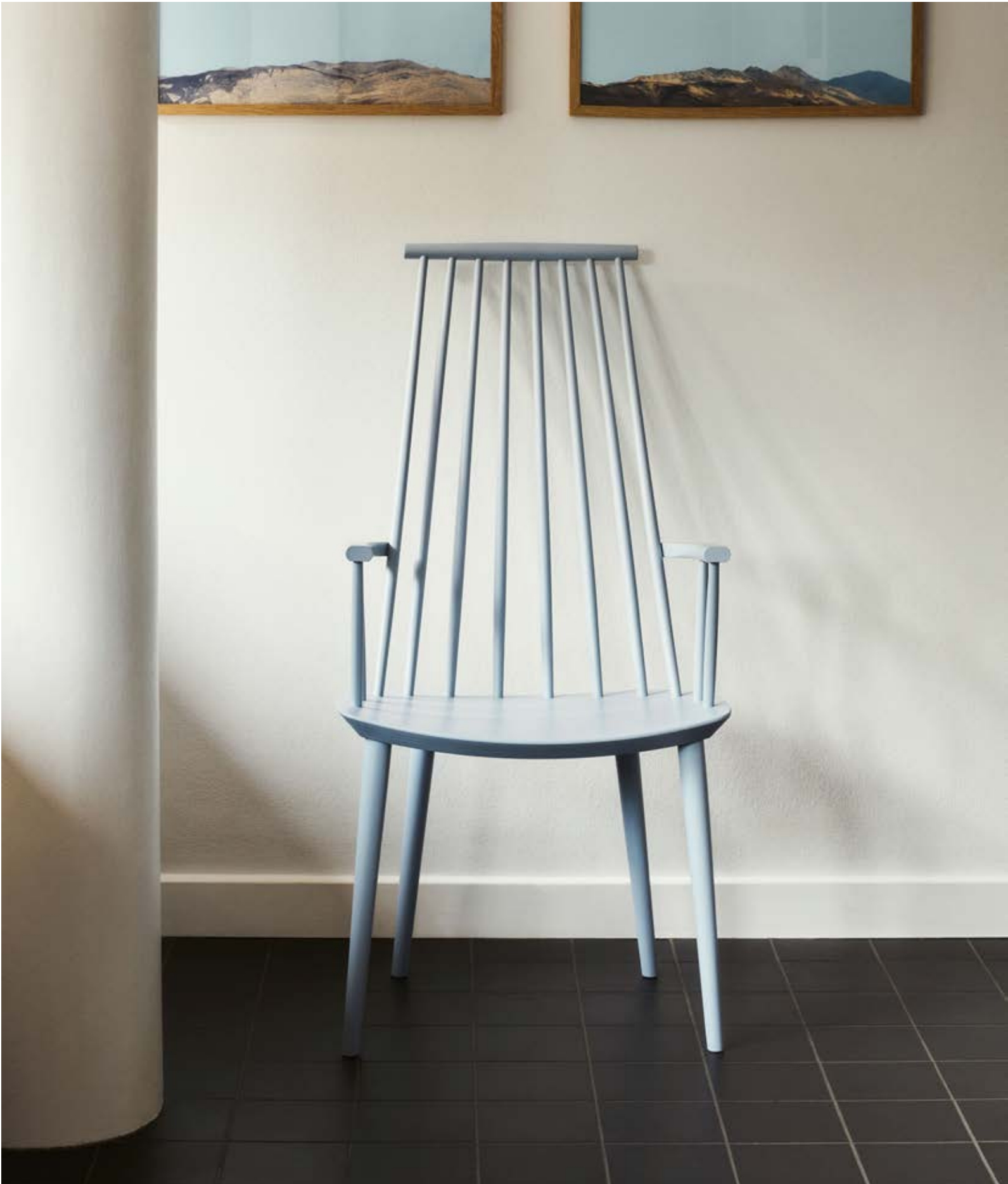
J110 Chair | Slate blue water-based lacquered beech