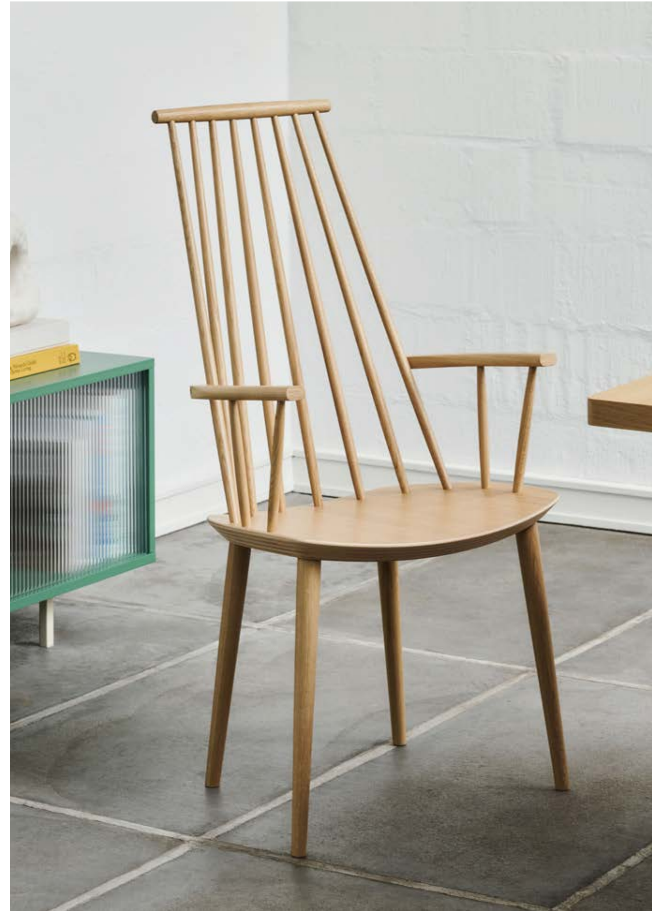
J110 Chair | Water-based lacquered oak