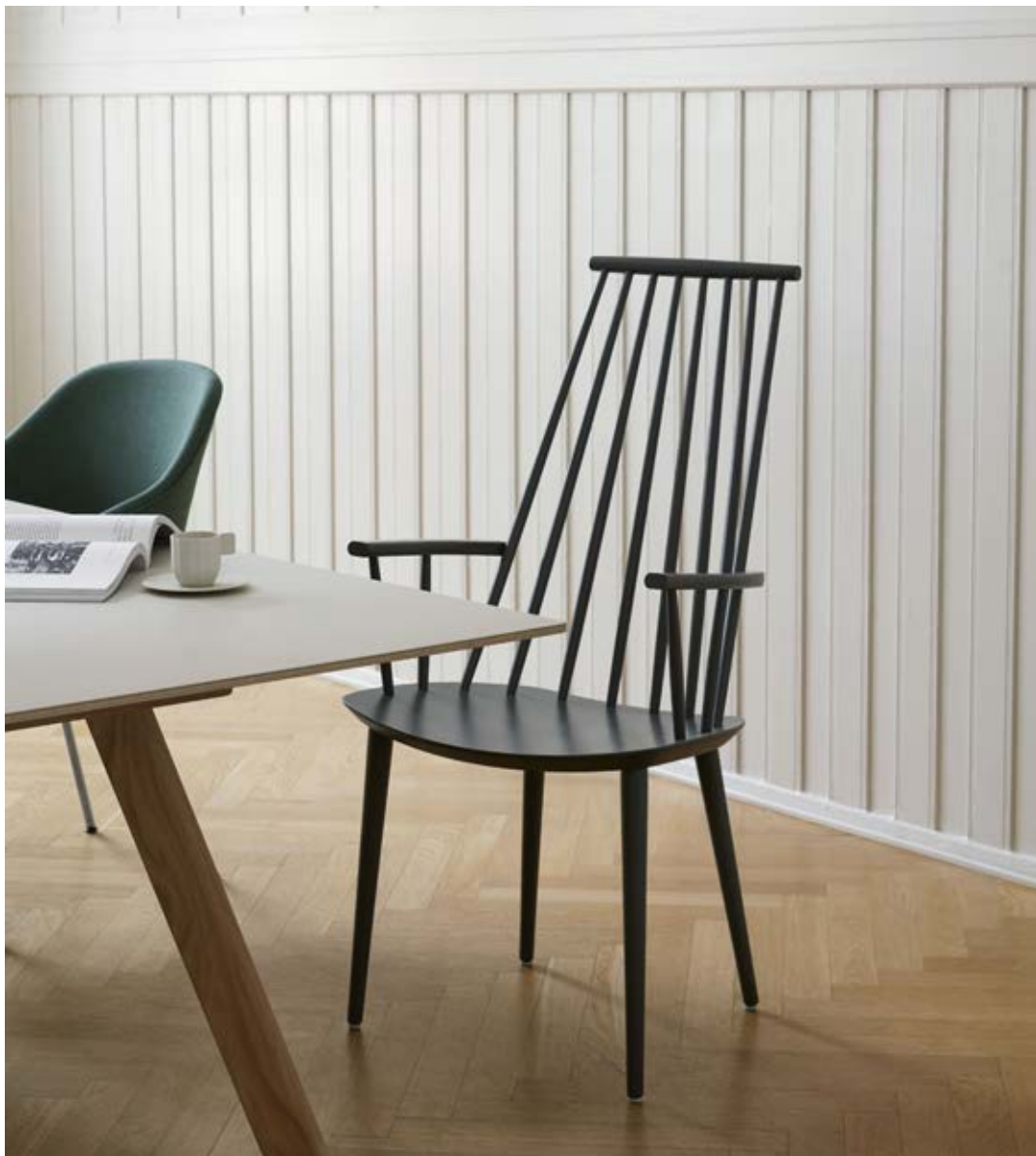
J110 Chair | Black water-based lacquered beech