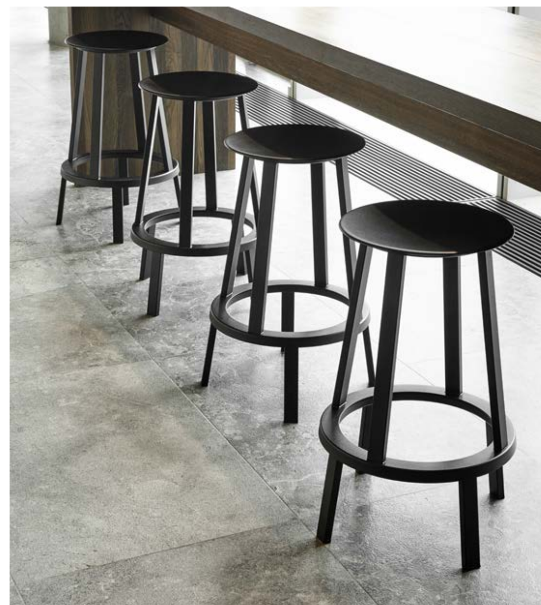
Revolver Bar Stool | Black powder coated steel