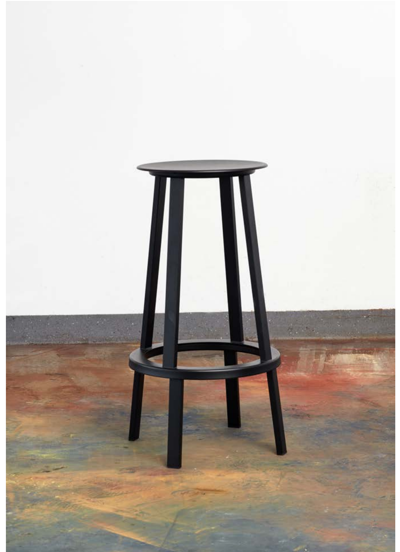
Revolver Bar Stool | Black powder coated steel