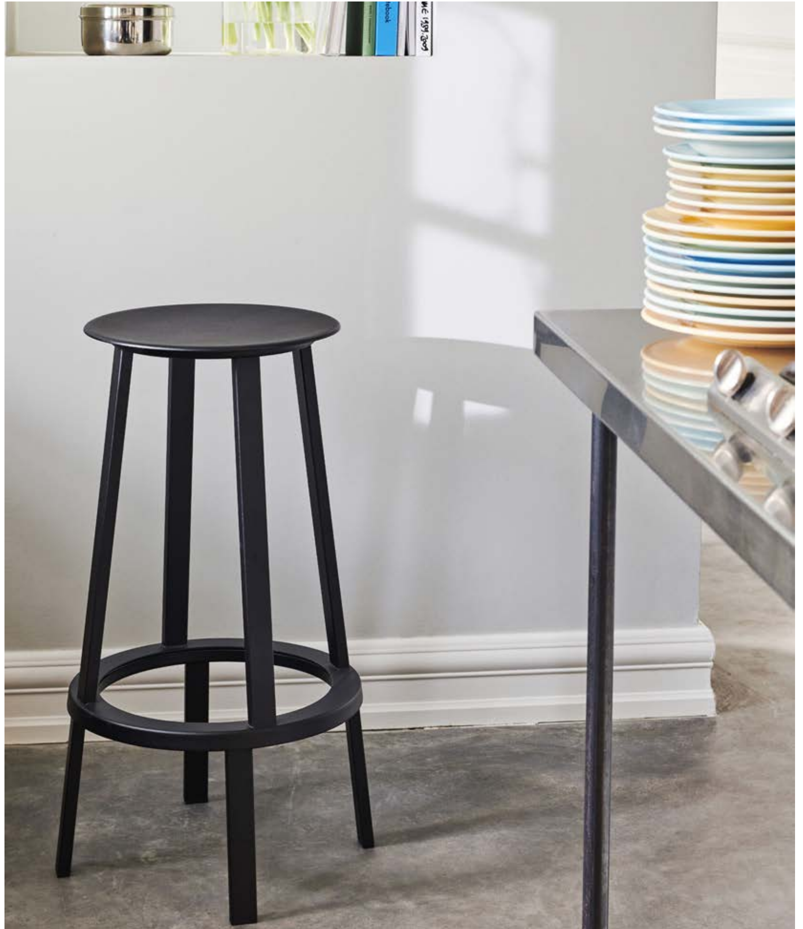
Revolver Bar Stool | Black powder coated steel