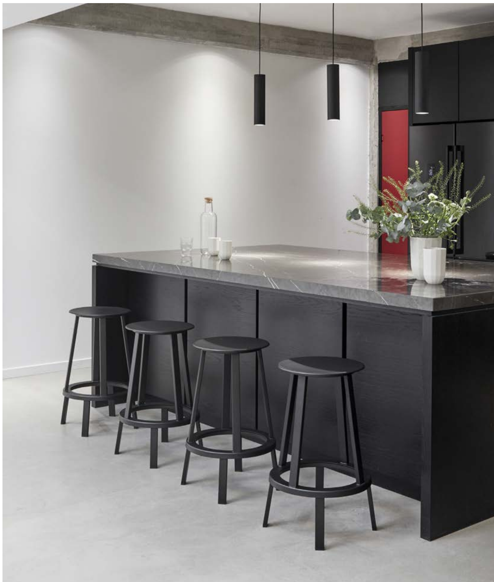
Revolver Bar Stool | Black powder coated steel