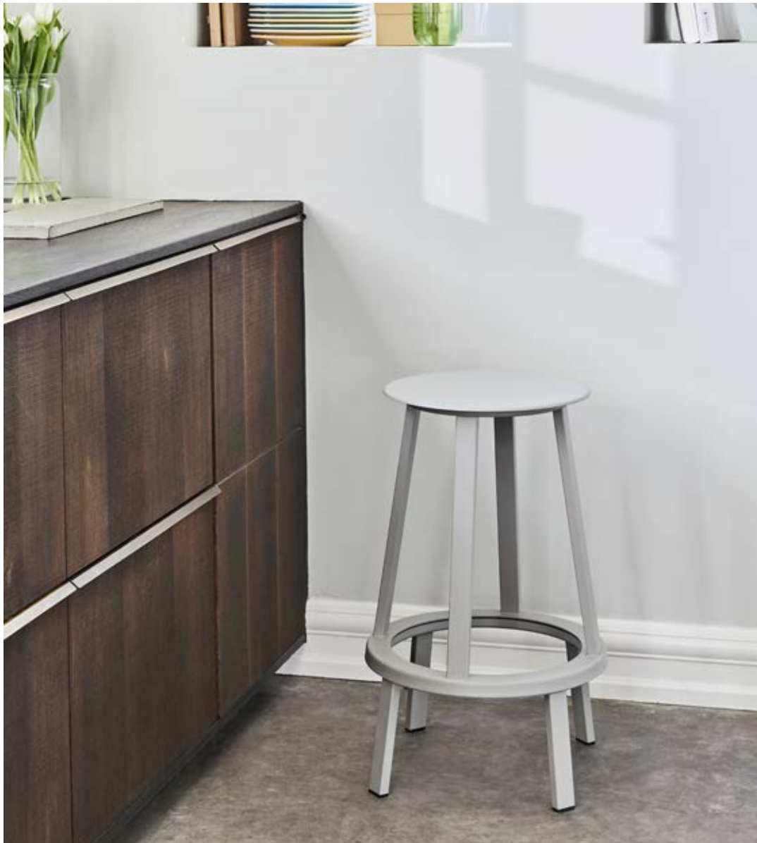
Revolver Bar Stool | Sky grey powder coated steel