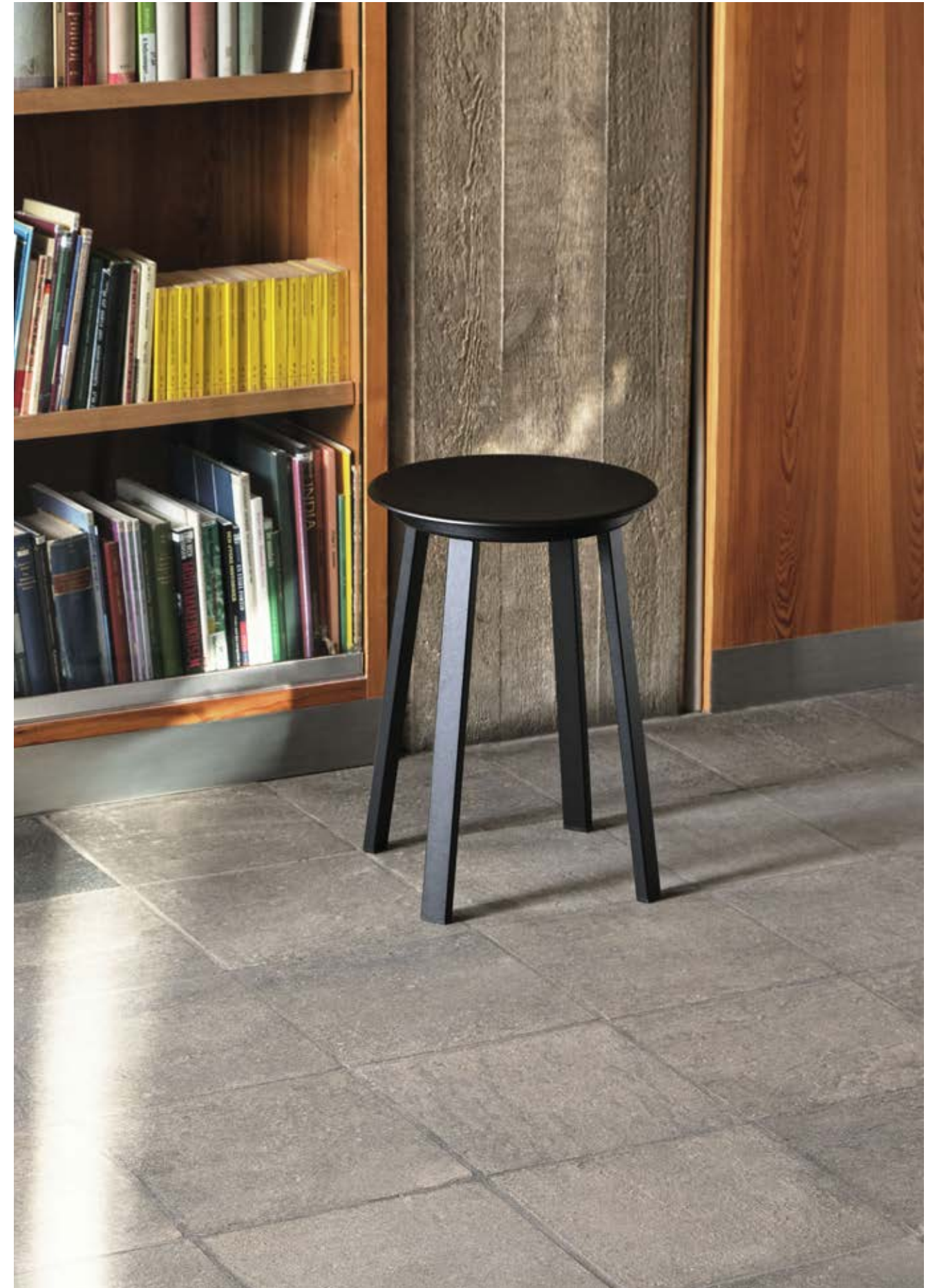
Revolver Stool | Black powder coated steel