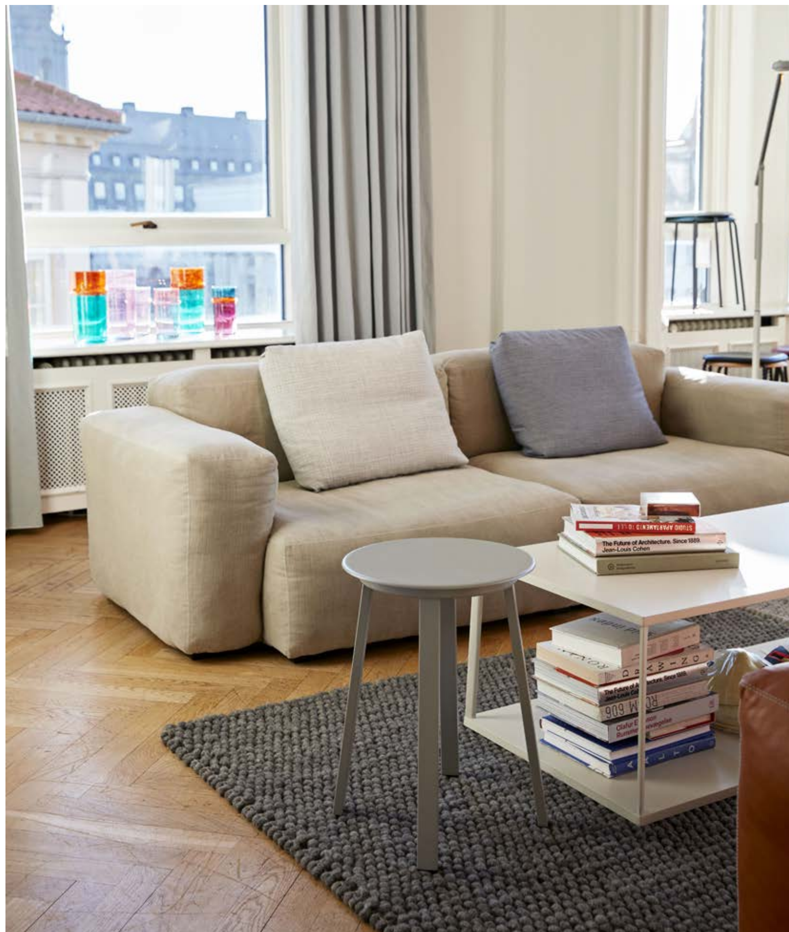
Revolver Stool | Sky grey powder coated steel