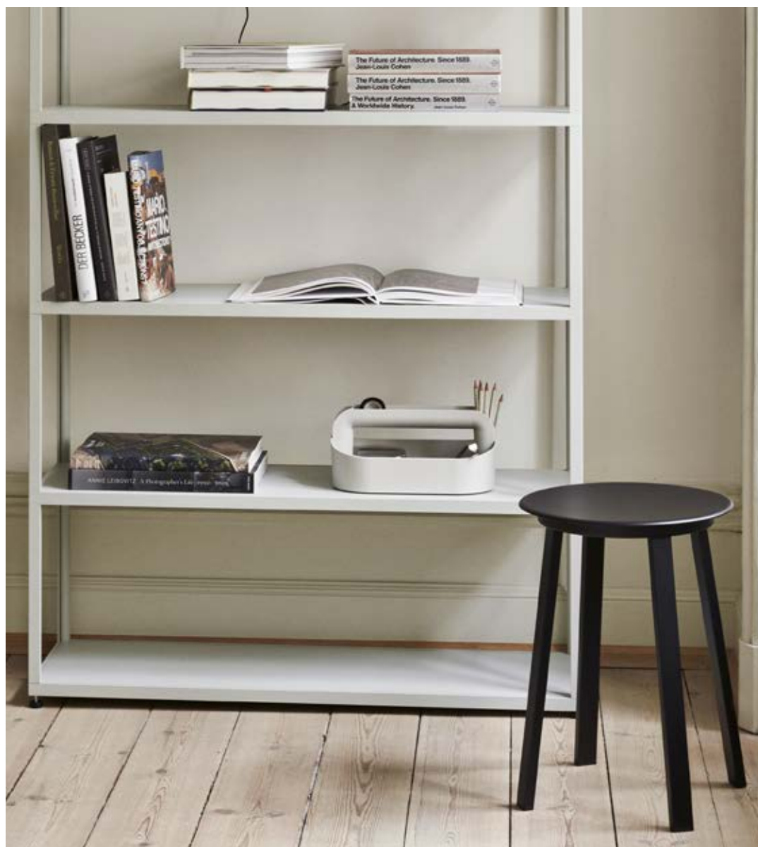
Revolver Stool | Black powder coated steel