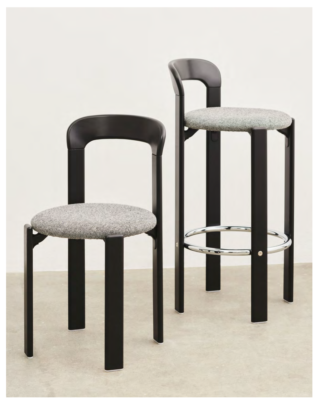
Deep Black, Steelcut Trio 124