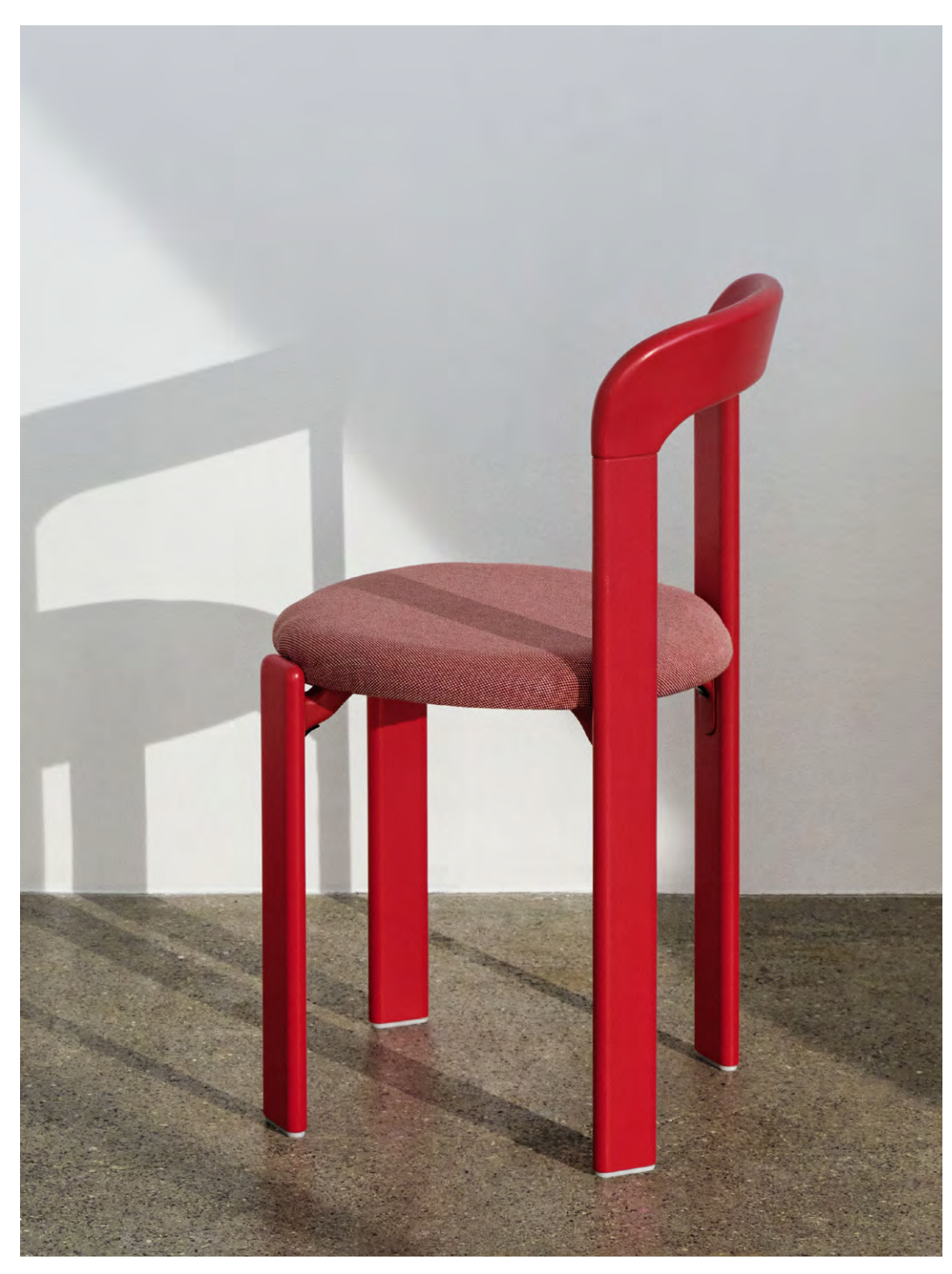
Scarlet red, Steelcut Trio 636