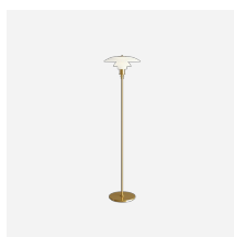
PH 3½-2½ Floor