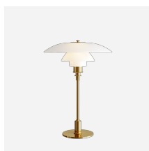
PH 3½-2½ Glass Table