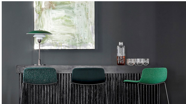
Fredericia Furniture Showroom