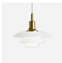
PH 3½-3 Glass Pendant