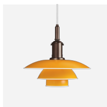
PH 3½-3 Pendant